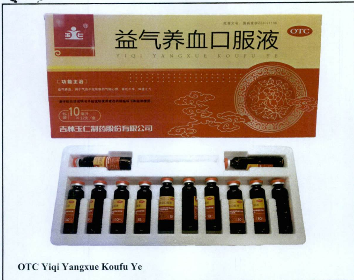
OTC Yiqi Yangxue Koufu Ye