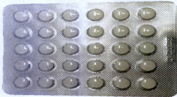
OTC Domperidone Tablets-Duopanlitiong Pian (as reflected in the package insert) by: Shanxibaotai Pharmaceutical Co., Ltd.