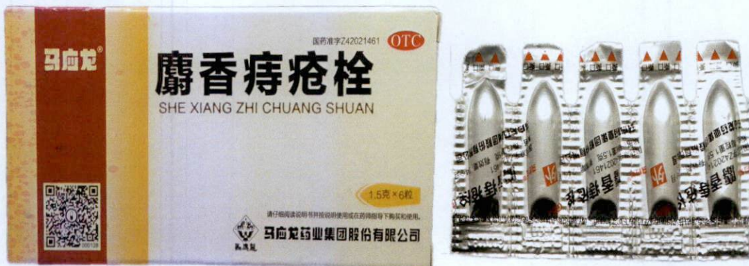
OTC She Xiang Zhi Chuang Shuan