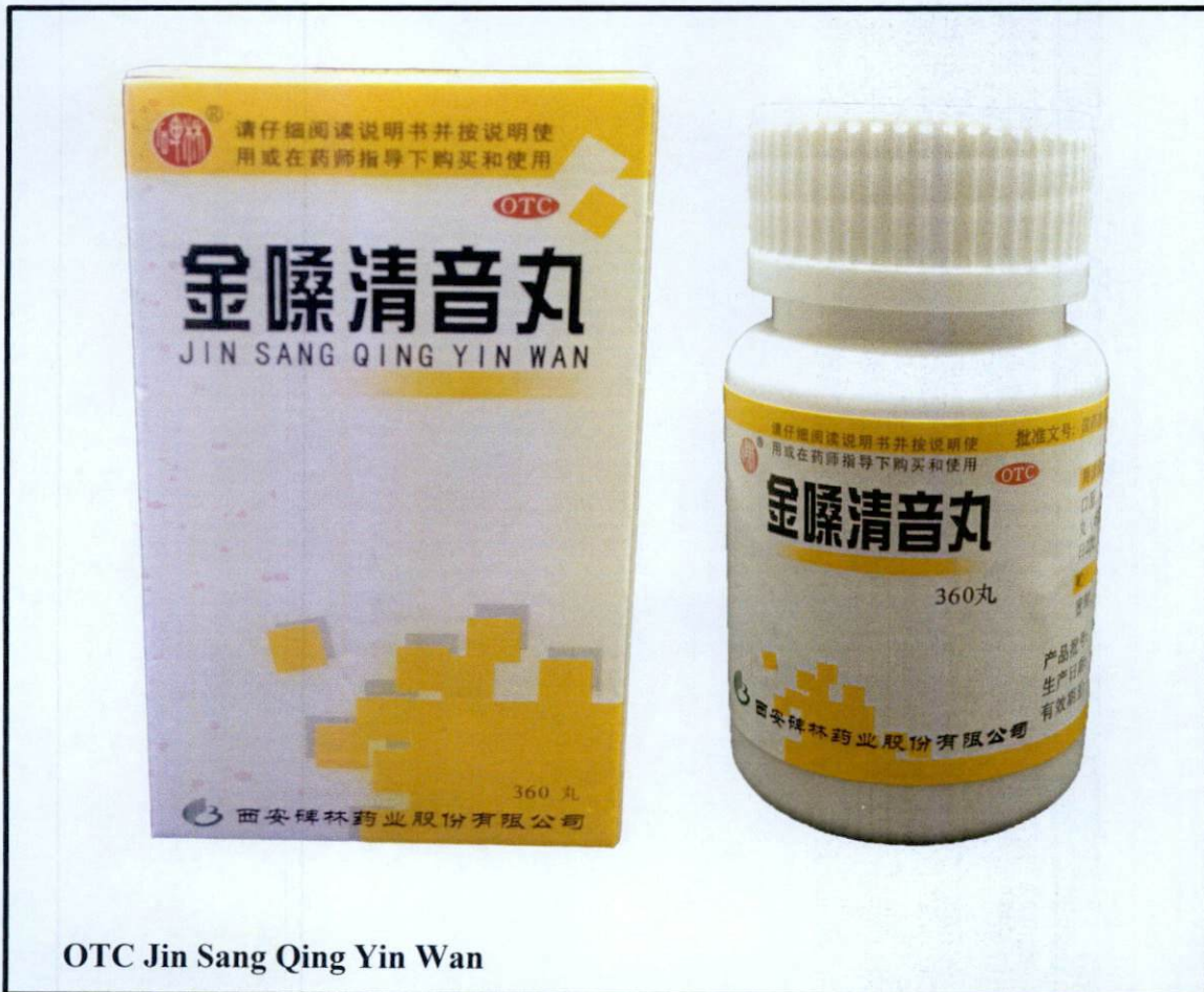
OTC Jin Sang Qing Yin Wan

The Food and Drug Administration (FDA) advises the public against the purchase and use of the following unregistered drug products: