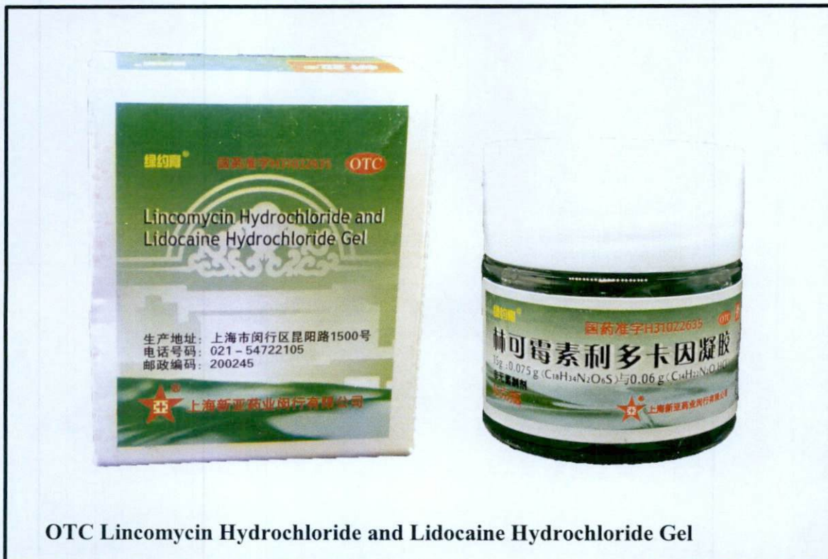
OTC Lincomycin Hydrochloride and Lidocaine Hydrochloride Gel