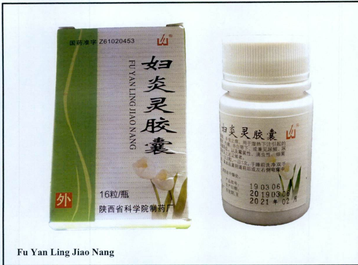
Fu Yan Ling Jiao Nang