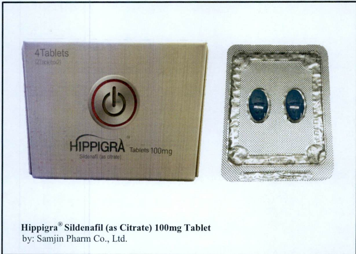
Hippigra® Sildenafil (as Citrate) 100mg Tablet by: Samjin Pharm Co., Ltd.