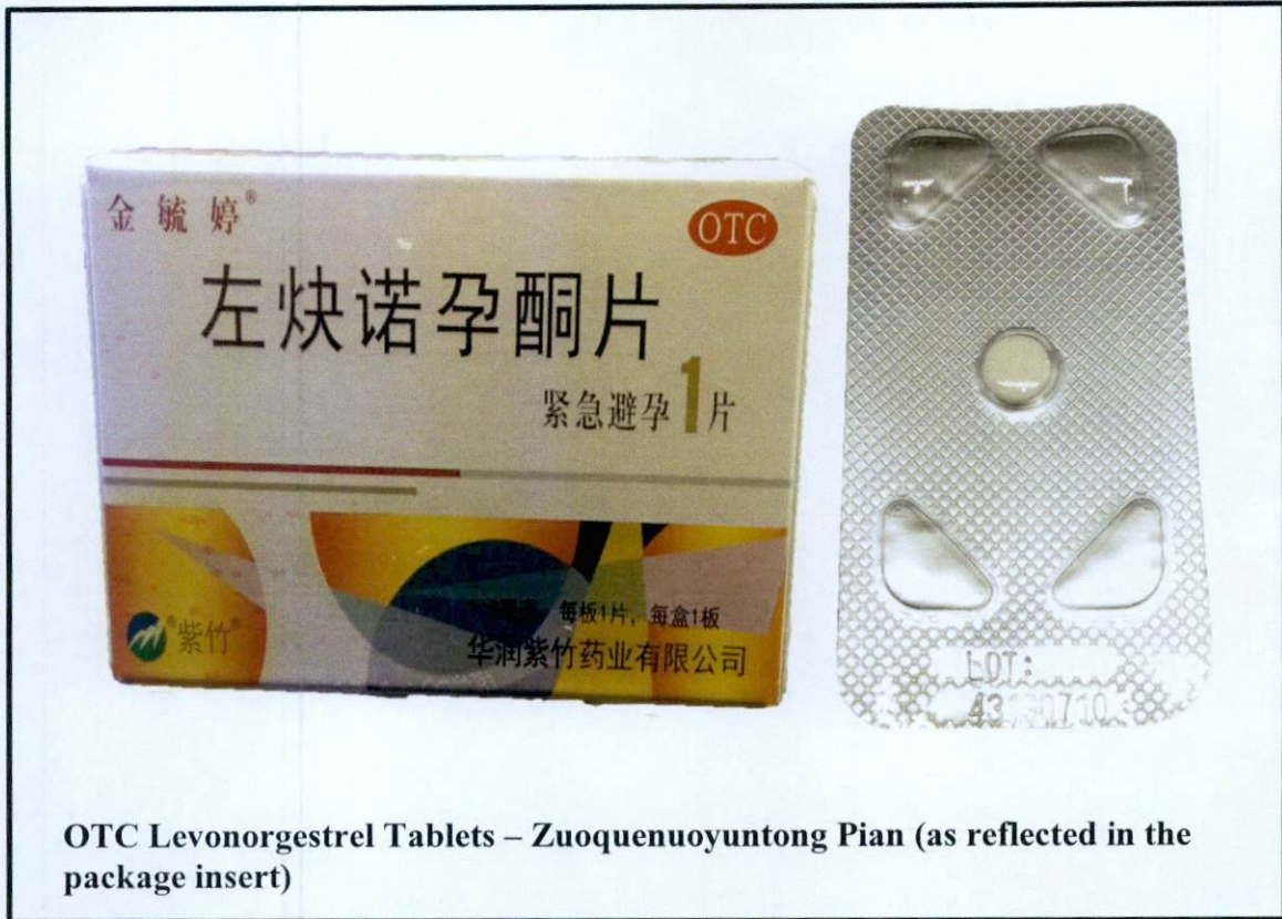
OTC Levonorgestrel Tablets – Zuoquenuoyuntong Pian (as reflected in the package insert)