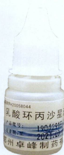
Jucishan® Ciprofloxacin Lactate Eye Drops) by: Zhengzhou Zhoufeng Pharmaceutical Co., Ltd.