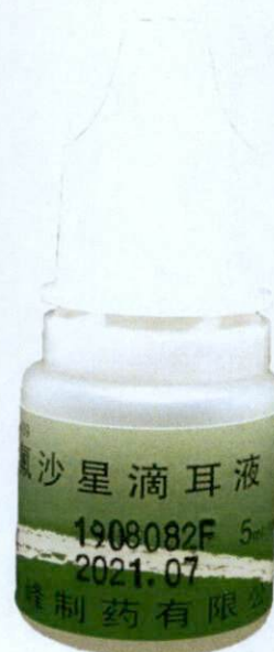
Jucishan® Ofloxacin Ear Drops by: Zhengzhou Zhoufeng Pharmaceutical Co., Ltd.