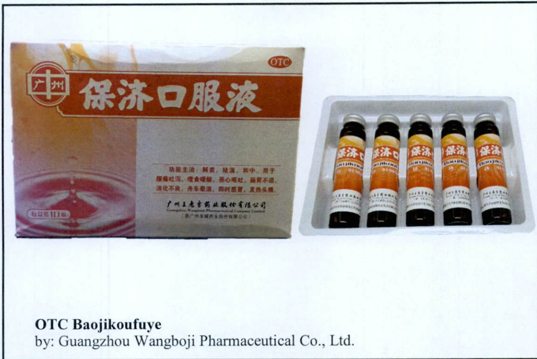
OTC Baojikoufuye by: Guangzhou Wangboji Pharmaceutical Co., Ltd.