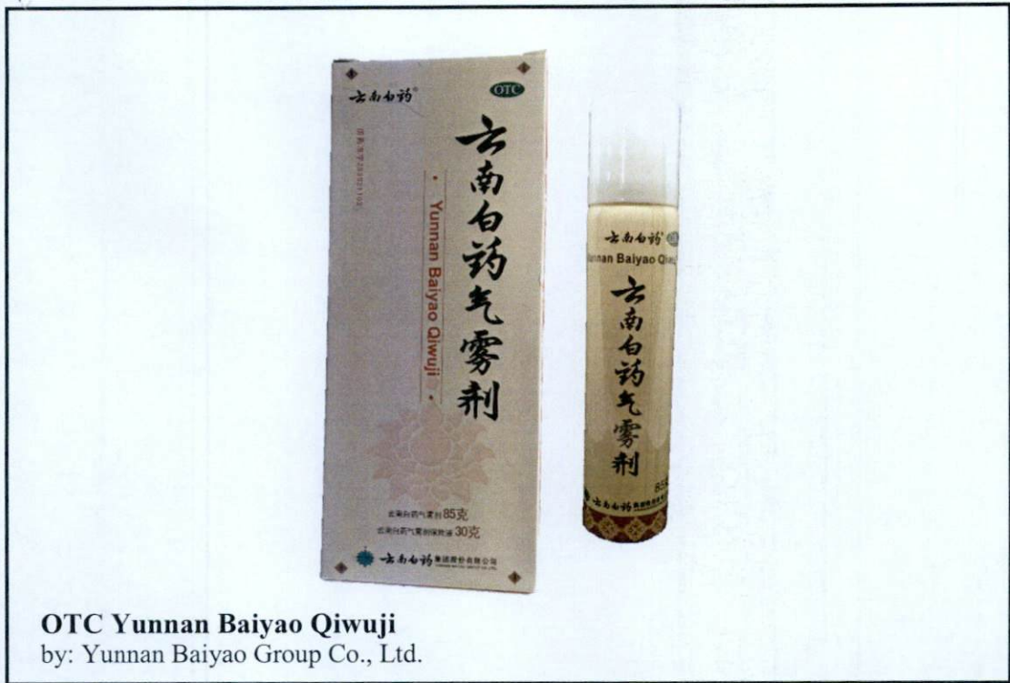
OTC Yunnan Baiyao Qiwuji by: Yunnan Baiyao Group Co., Ltd.