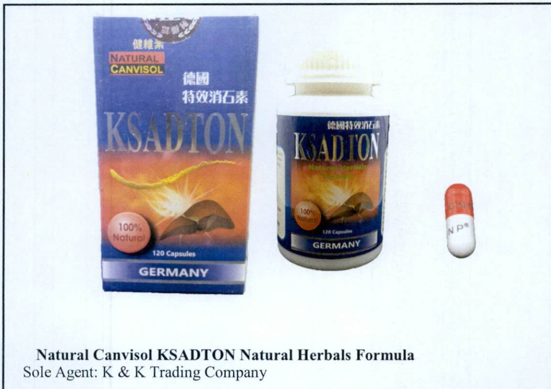
Natural Canvisol KSADTON Natural Herbals Formula Sole Agent: K & K Trading Company