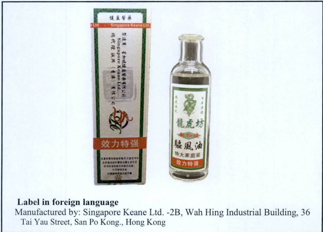
Label in foreign language Manufactured by: Singapore Keane Ltd. -2B, Wah Hing Industrial Building, 36 Tai Yau Street, San Po Kong., Hong Kong