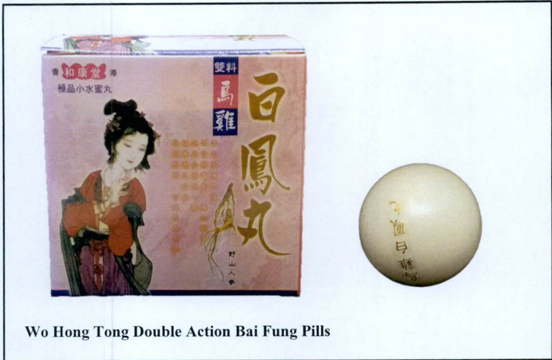
Wo Hong Tong Double Action Bai Fung Pills