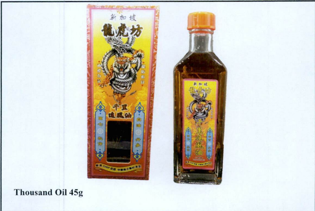
Thousand Oil 45g