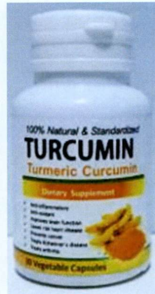
Figure 3. Unregistered TURCUMIN 100% Natural & Standardized Turmeric Curcumin