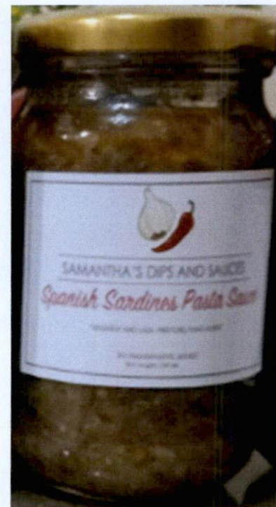
Figure 5. Unregistered SAMANTHA'S DIPS AND SAUCE Spanish Sardines Paste Sauce