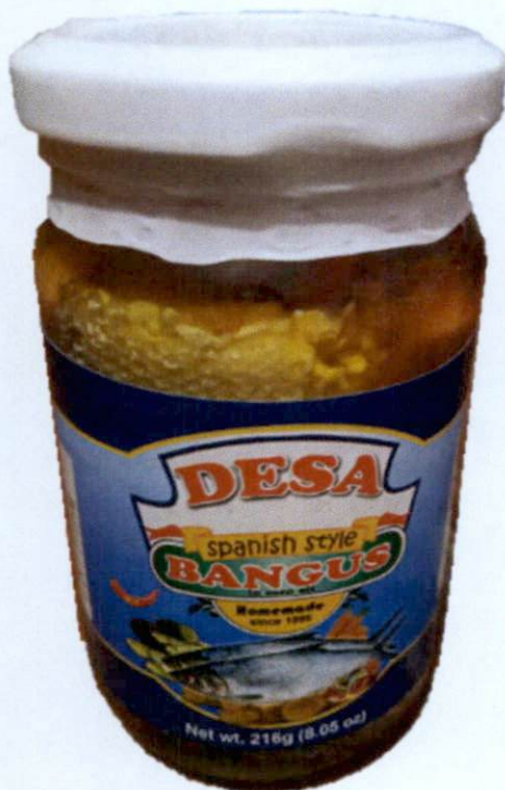
Figure 4. Unregistered DESA Spanish Style Bangus in Corn Oil