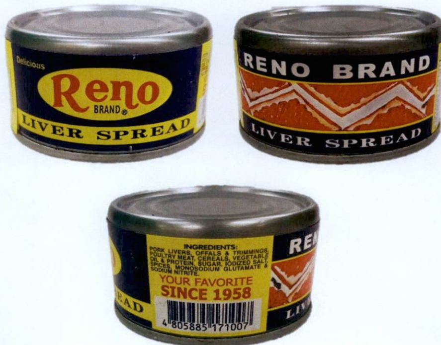
Figure 1. Unregistered RENO BRAND Liver Spread

The Food and Drug Administration (FDA) warns all healthcare professionals and the general public NOT TO PURCHASE AND CONSUME the following unregistered food products and food supplements: