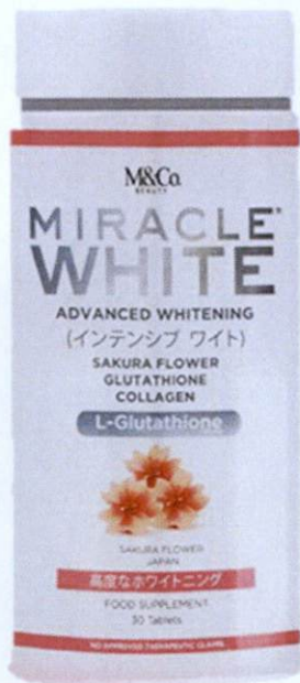
Figure 2. Unregistered MIRACLE WHITE Advance Whitening Capsules Food Supplement