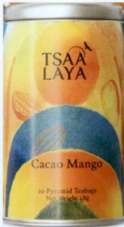
Figure 4. Unregistered TSAA LAYA Cacao Mango Canister of 10 Teabags