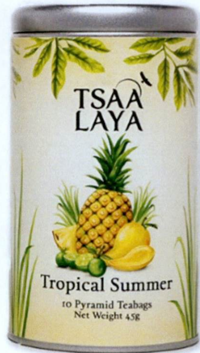
Figure 5. Unregistered TSAA LAYA Tropical Summer Canister of 10 Teabags