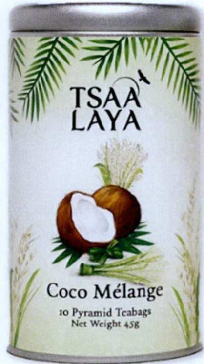
Figure 3. Unregistered TSAA LAYA Coco Mèlange Canister of 10 Teabags