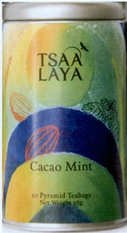
Figure 2. Unregistered TSAA LAYA Cacao Mint Canister of 10 Teabags