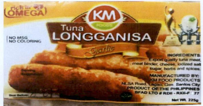
Figure 5. KM FOODS Tuna Longganisa, Garlic