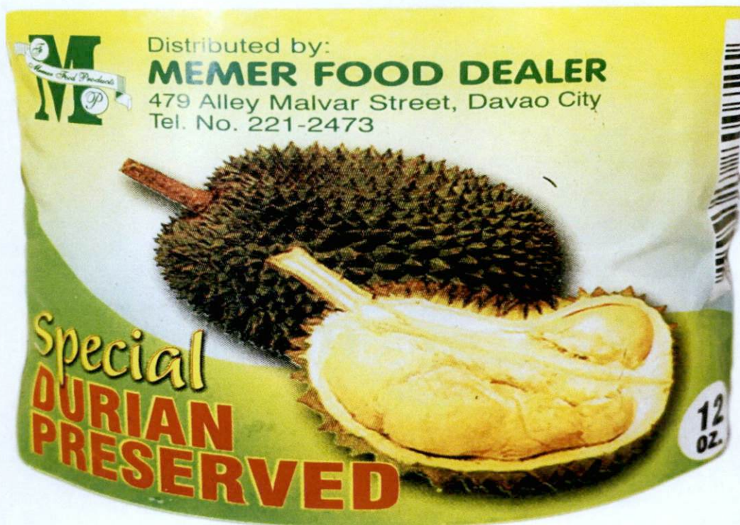
Figure 1. Unregistered MEMER FOOD DEALER Special Durian Preserved, 12oz

The Food and Drug Administration (FDA) warns all healthcare professionals and the general public NOT TO PURCHASE AND CONSUME the following unregistered food products: