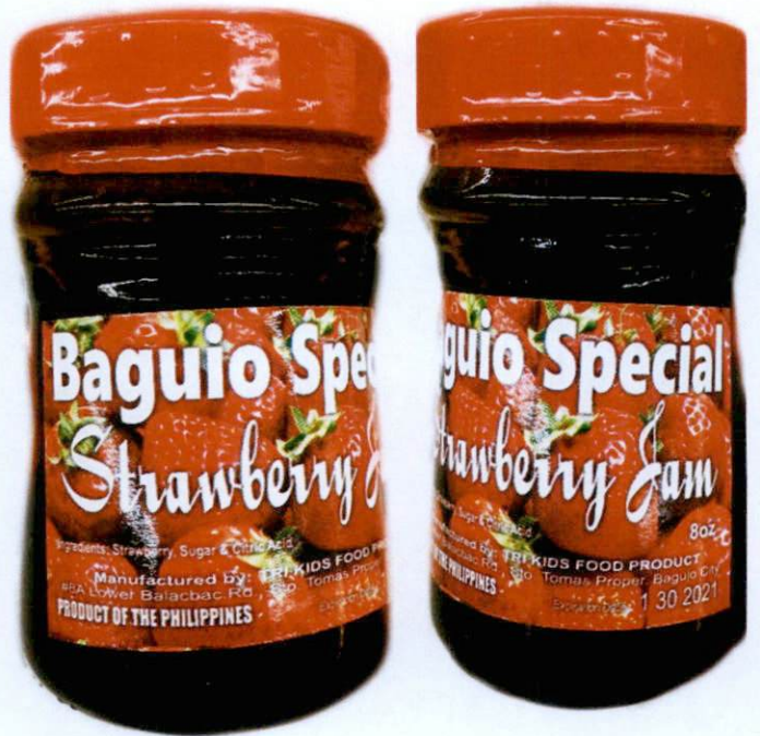
Figure 3. Unregistered BAGUIO SPECIAL Strawberry Jam