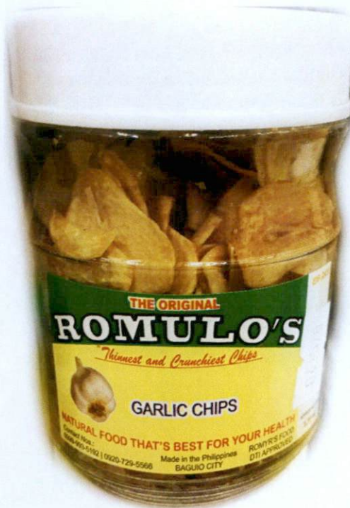
Figure 4. Unregistered THE ORIGINAL ROMULO'S Thinnest and Crunchiest Chips, Garlic Chips