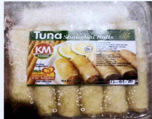
Figure 3. Unregistered KM FOODS TUNA, Shanghai Rolls