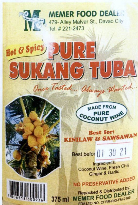
Figure 4. Unregistered MEMER FOOD DEALER Hot & Spicy Pure Sukang Tuba, 375ml