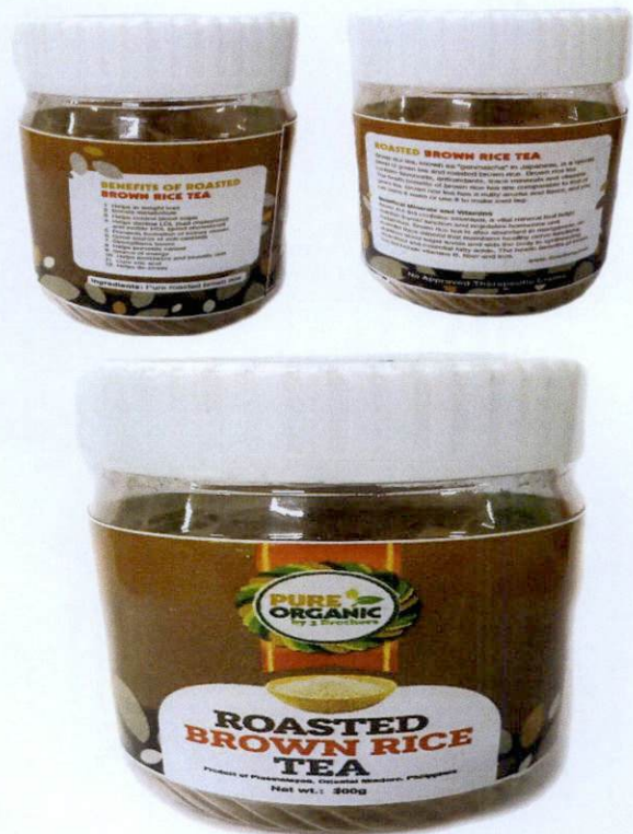
Figure 5. Unregistered PURE ORGANIC BY 3 BROTHERS Roasted Brown Rice Tea, 100g