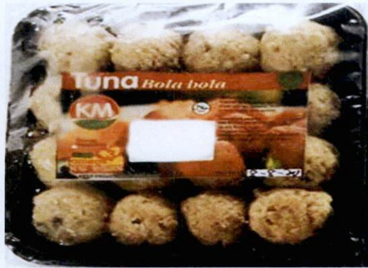
Figure 2. Unregistered KM FOODS TUNA Bola-Bola, 250g