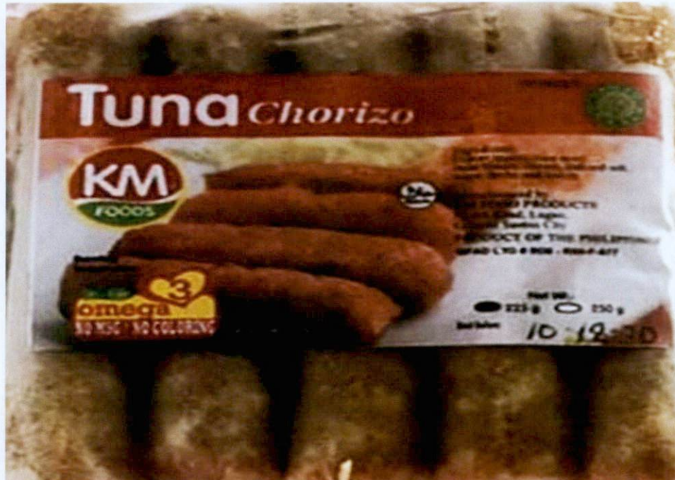
Figure 1. Unregistered KM FOODS TUNA Chorizo,225g

The Food and Drug Administration (FDA) warns all healthcare professionals and the general public NOT TO PURCHASE AND CONSUME the following unregistered food products: