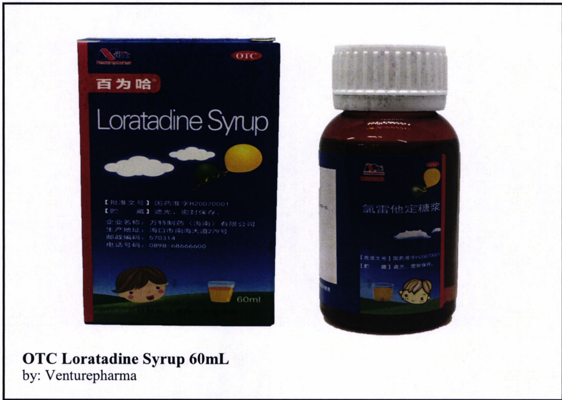
Figure 2. Unregistered drug