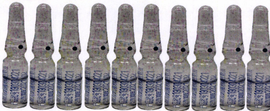
Raceanisodamine Hydrochloride Injection 1ml : 10mg