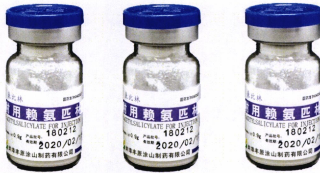
Lysine Acetylsalicylate for Injection 0.9g