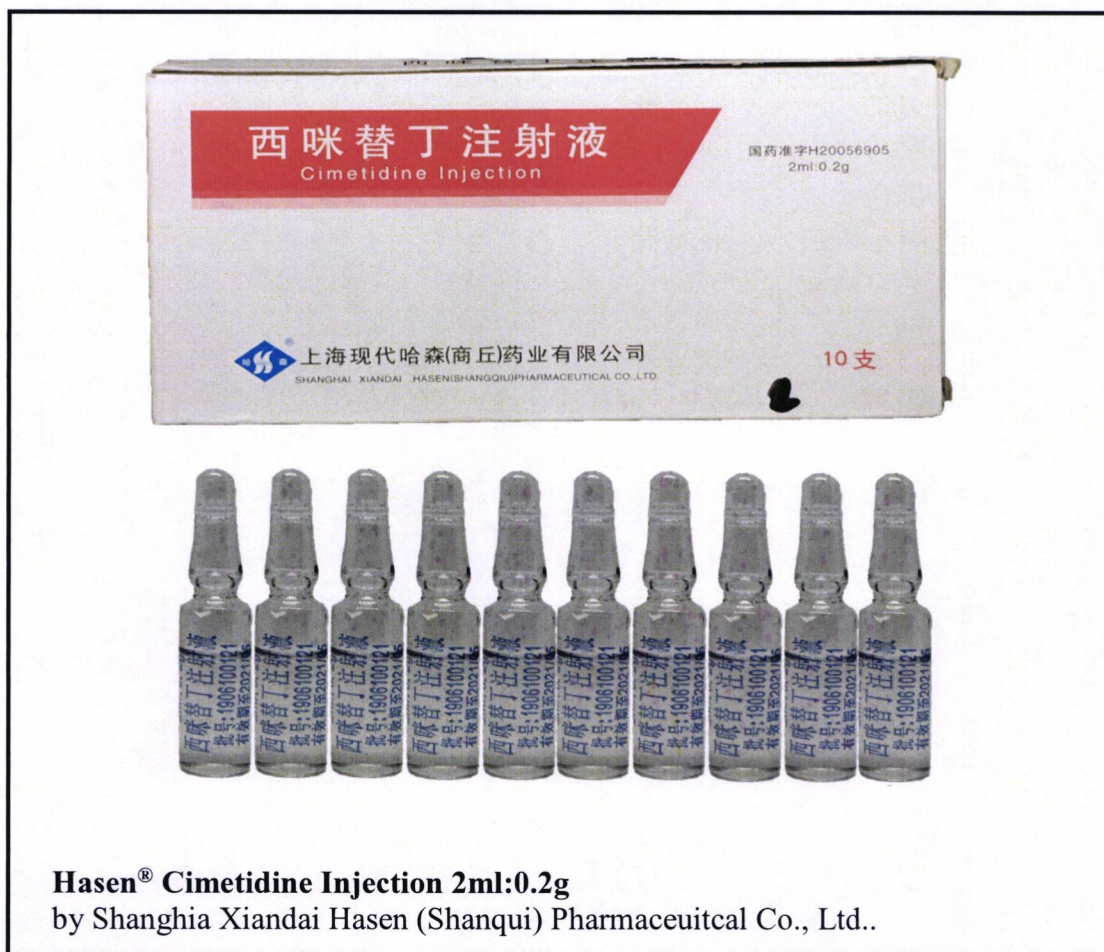
Hasen® Cimetidine Injection 2ml:0.2g by Shanghia Xiandai Hasen (Shanqi) Pharmaceutcal Co., Ltd..