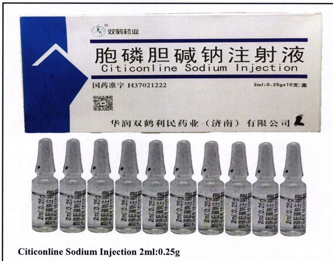
Citiconline Sodium Injection 2ml:0.25g

The Food and Drug Administration (FDA) advises the public against the purchase and use of the following unregistered drug products: