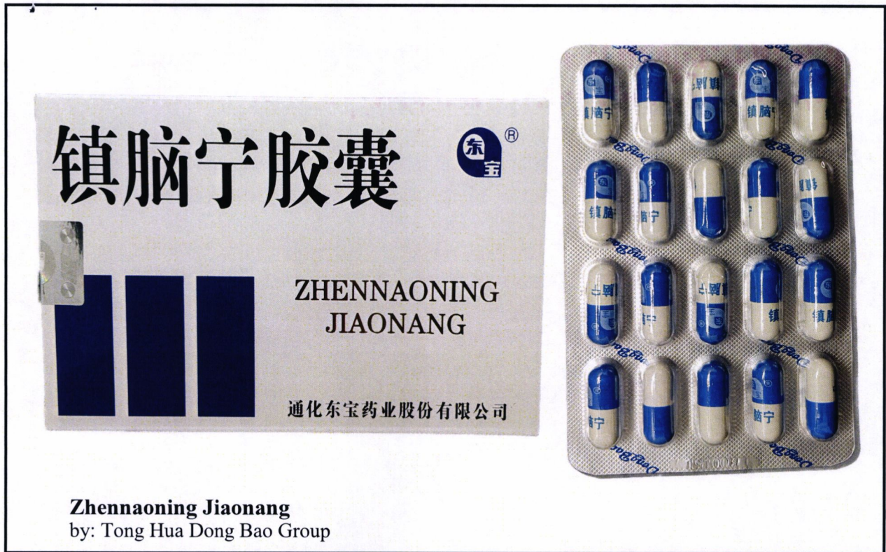
Zhennaoning Jiaonang by: Tong Hua Dong Bao Group