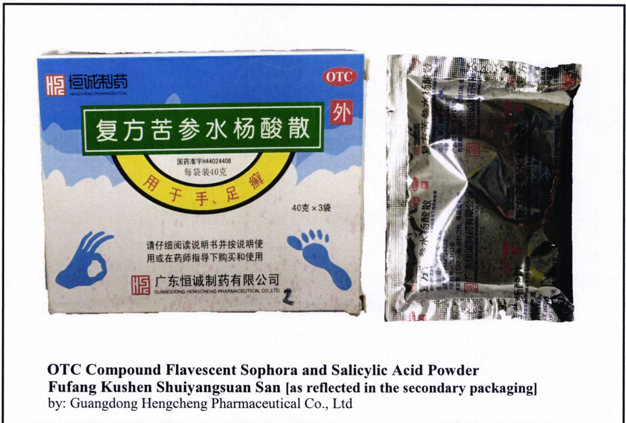
OTC Compound Flavescent Sophora and Salicylic Acid Powder Fufang Kushen Shuiyangsuan San [as reflected in the secondary packaging] by: Guangdong Hengcheng Pharmaceutical Co., Ltd