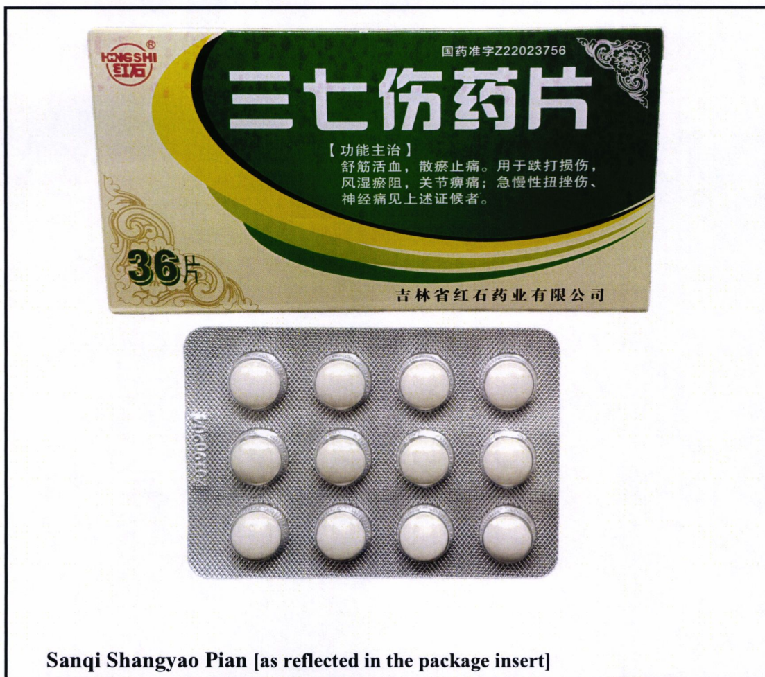
Figure 4. Unregistered drug product