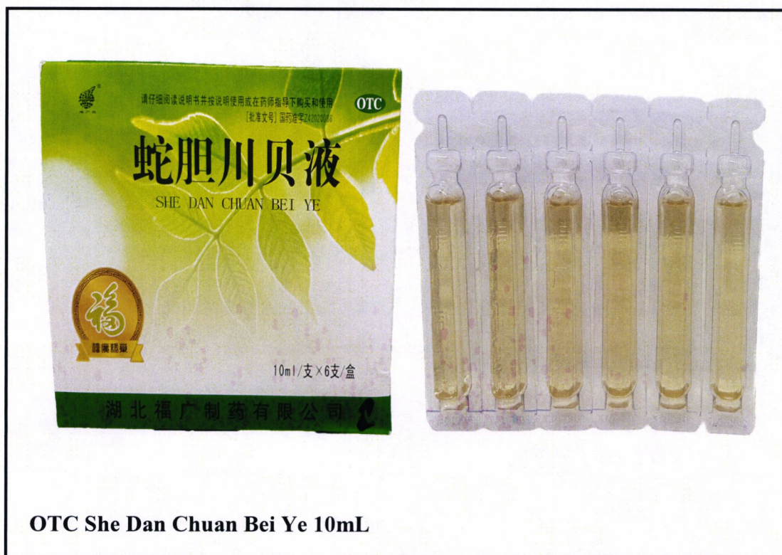
OTC She Dan Chuan Bei Ye 10mL

The Food and Drug Administration (FDA) advises the public against the purchase and use of the following unregistered drug products: