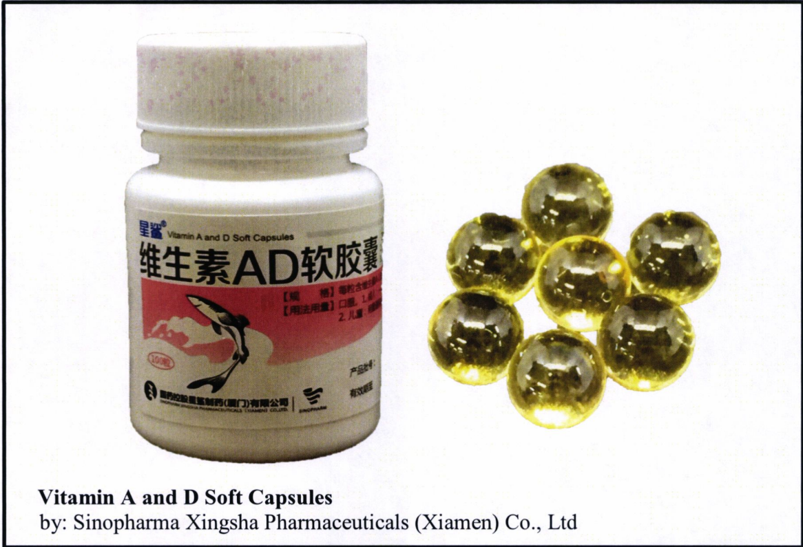
Vitamin A and D Soft Capsules by: Sinopharma Xingsha Pharmaceuticals (Xiamen) Co., Ltd