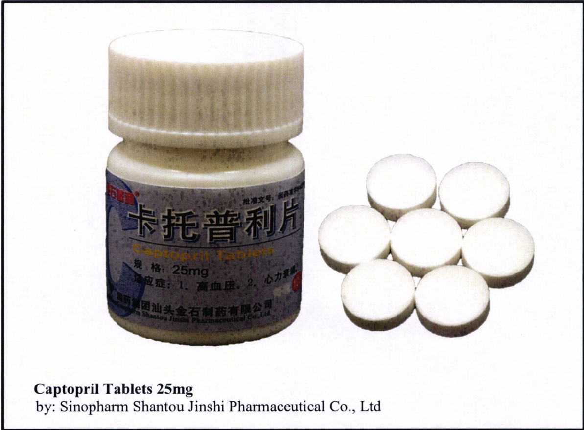
Captopril Tablets 25mg by: Sinopharm Shantou Jinshi Pharmaceutical Co., Ltd