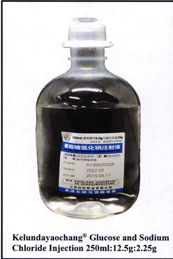
Kelundayaochang® Glucose and Sodium Chloride Injection 250ml:12.5g:2.25g