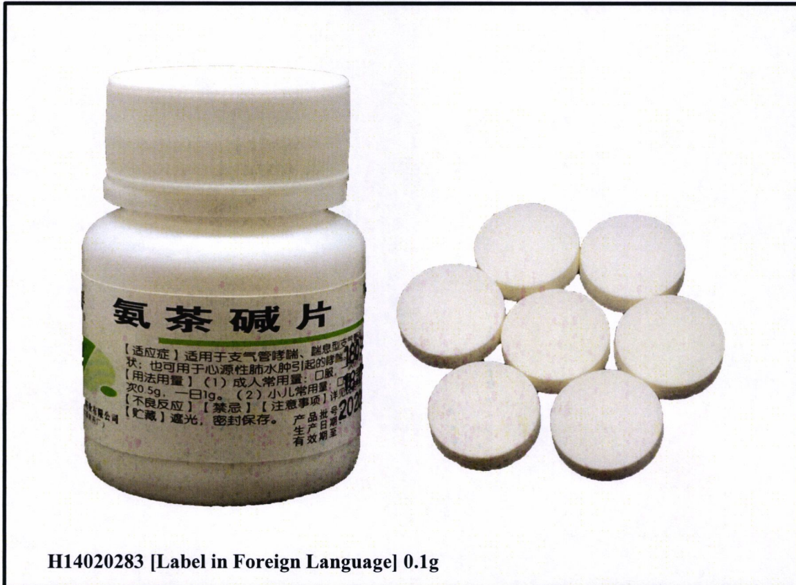
H14020283 [Label in Foreign Language] 0.1g

The Food and Drug Administration (FDA) advises the public against the purchase and use of the following unregistered drug products: