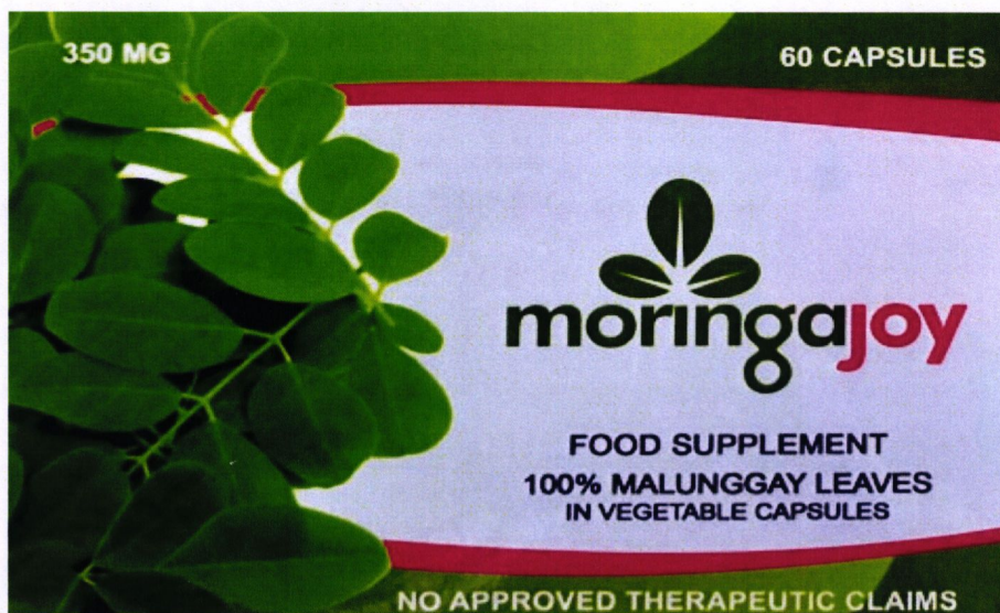
Figure 4. Unregistered MORINGAJOY Food Supplement, 100% Malunggay Leaves in Vegetable Capsules, 350mg, 60 Capsules