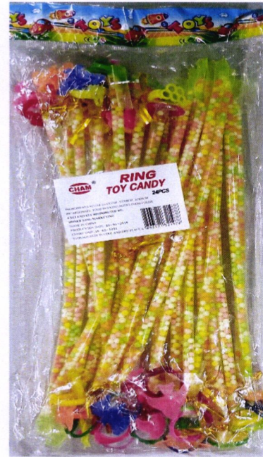
Figure 3. Unregistered CHAM Ring Toy Candy, 24pcs