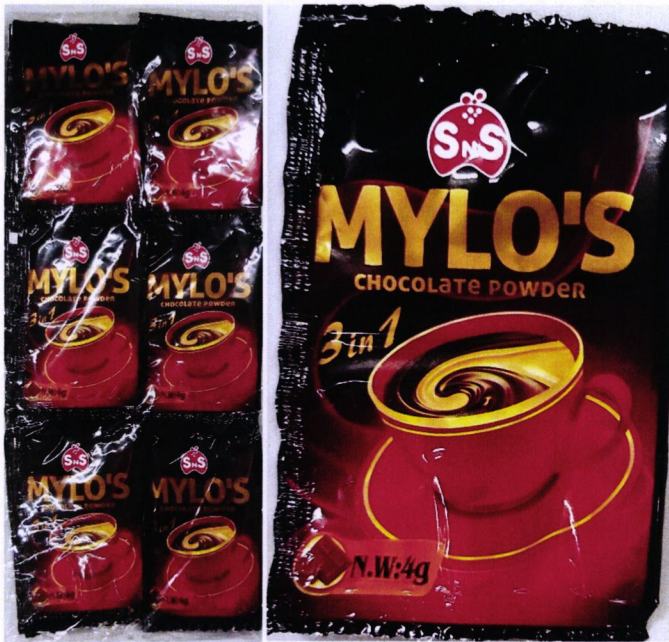
Figure 2. Unregistered SNS MYLO'S Chocolate Powder 3 in 1