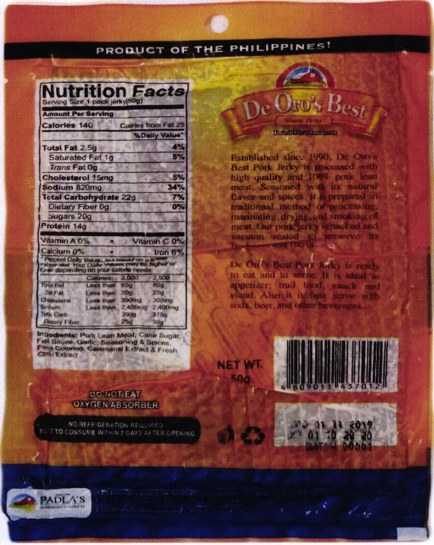
Figure 5. Unregistered PADLA'S HOMEMADE PRODUCTS DE ORO'S BEST Original Pork Jerky, 50g