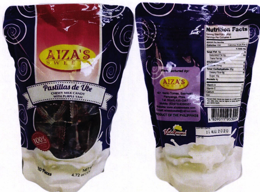
Figure 1. Unregistered AIZA'S SWEETS Pastillas de Ube Chewy Milk Candy, with Purple Yam, 20 Pieces, 134g

The Food and Drug Administration (FDA) warns all healthcare professionals and the general public NOT TO PURCHASE AND CONSUME the following unregistered food products: