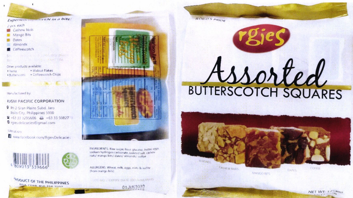
Figure 2. Unregistered RGIES Assorted Butterscotch Squares, 175gms