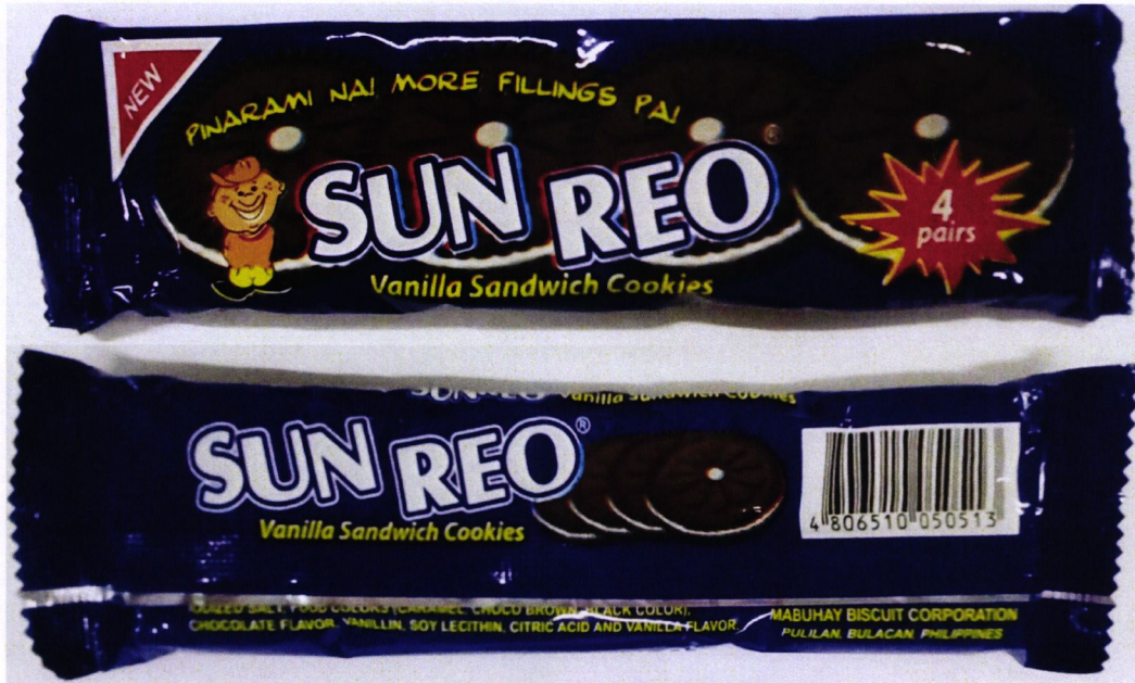
Figure 1. Unregistered SUN REO Vanilla Sandwich Cookies, 4 pairs, 33g (1.16oz)

The Food and Drug Administration (FDA) warns all healthcare professionals and the general public NOT TO PURCHASE AND CONSUME the following unregistered food products and food supplement: