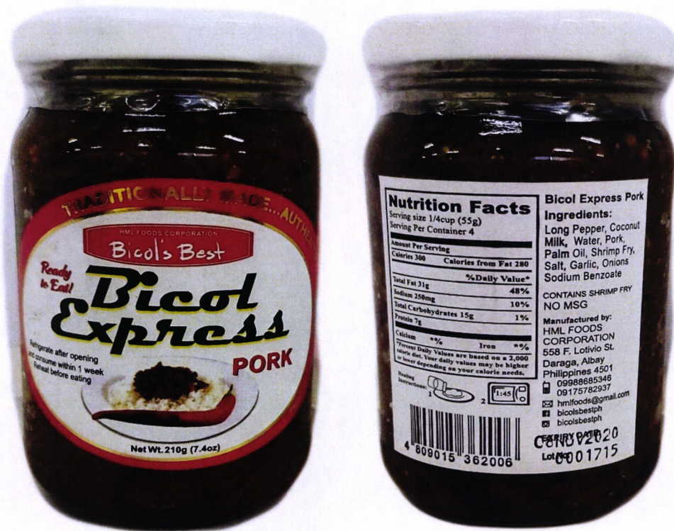
Figure 2. Unregistered HML FOODS CORPORATION BICOL'S BEST Ready to Eat Bicol Express, Pork, 210g (17oz)