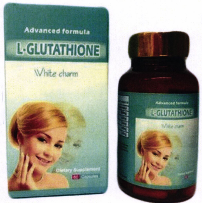
Figure 5. Unregistered ADVANCE FORMULA L-Glutathione, White Charm, Dietary Supplement, 60 Capsules