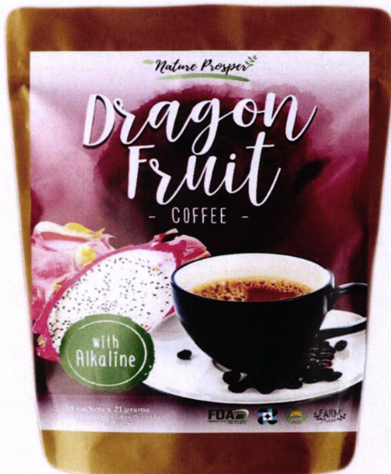
Figure 3. Unregistered NATURE PROSPER Dragon Fruit Coffee Sugar