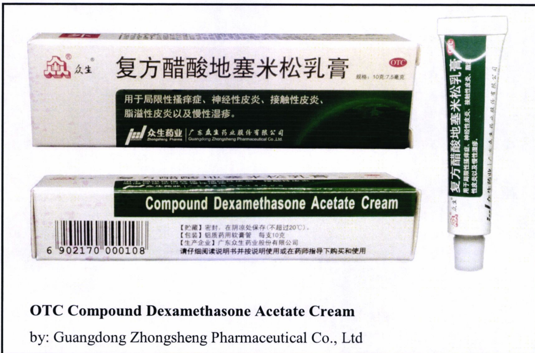
OTC Compound Dexamethasone Acetate Cream