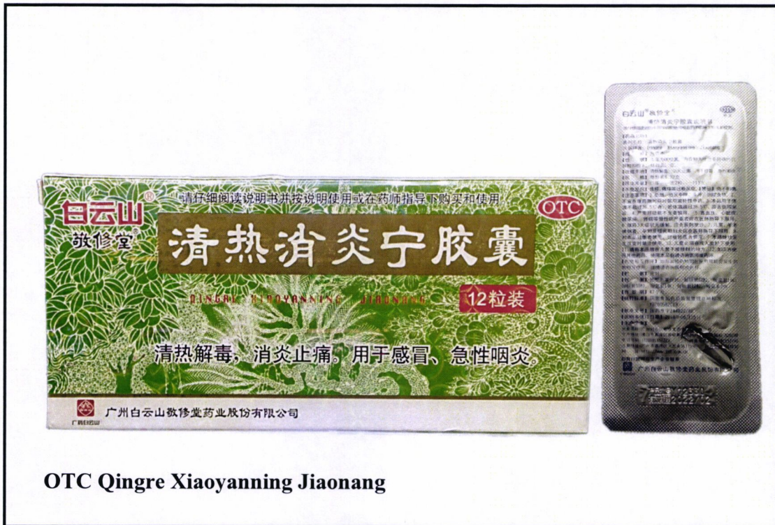
OTC Qingre Xiaoyanning Jiaonang