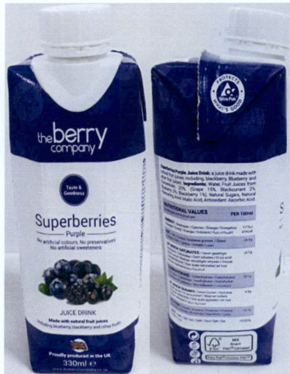
Figure 1. Principal Display Panel of the Approved label of THE BERRY COMPANY Superberries Purple, Juice Drink (330ml) with registration number FR-4000003028449 valid until 02 July 2024.

The Food and Drug Administration (FDA) informs the public that the food product THE BERRY COMPANY Superberries Purple, Juice Drink (330ml) is registered by the Market Authorization Holder, Yummy Organics Food Products in accordance to existing FDA rules and regulations.