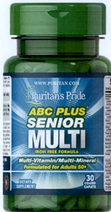
Figure 1. PURITAN'S PRIDE ABC PLUS SENIOR MULTI DIETARY SUPPLEMENT, FR-4000006649546 issued on 14 August 2020 valid until 14 August 2022

The Food and Drug Administration (FDA) informs the public that the food supplement PURITAN'S PRIDE ABC PLUS SENIOR MULTI DIETARY SUPPLEMENT has been registered by the Market Authorization Holder (MAH) ALPHACOMMERCE CORPORATION , in accordance to existing FDA rules and regulations.