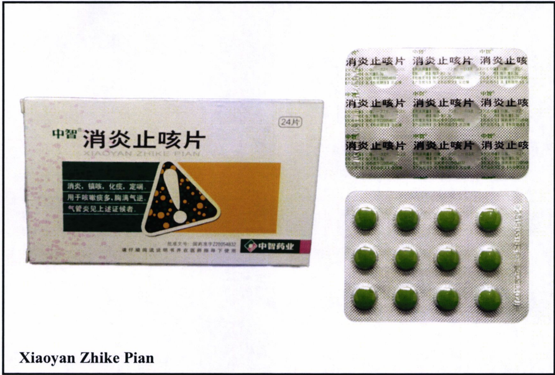
Xiaoyan Zhike Pian