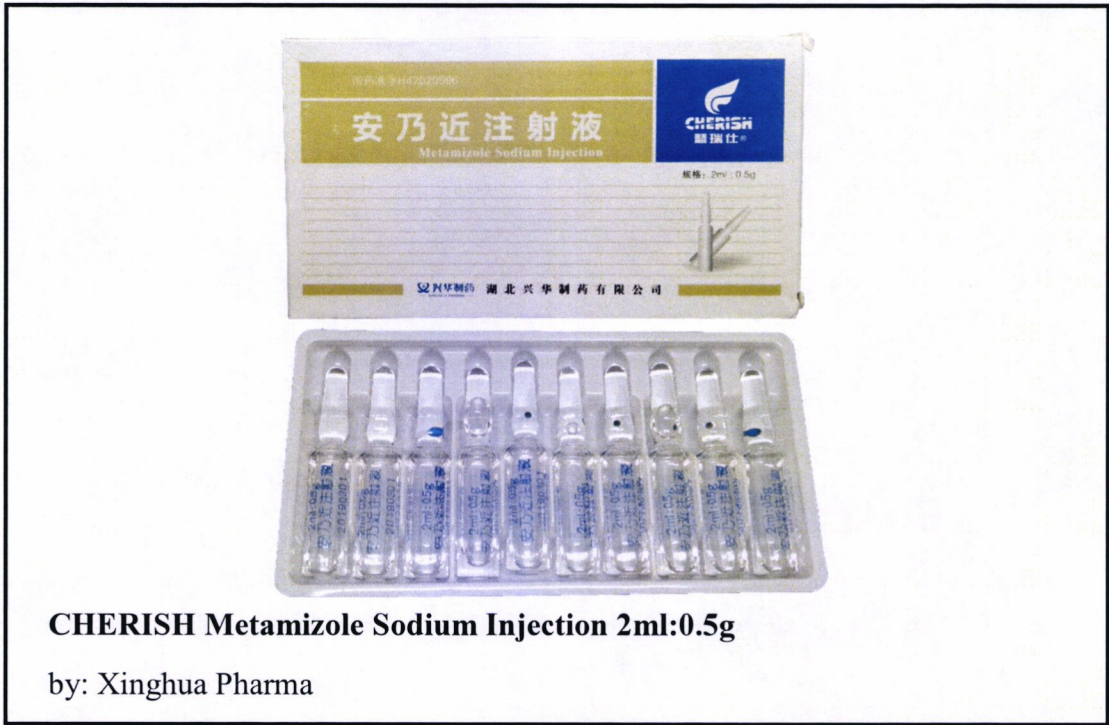
CHERISH Metamizole Sodium Injection 2ml:0.5g