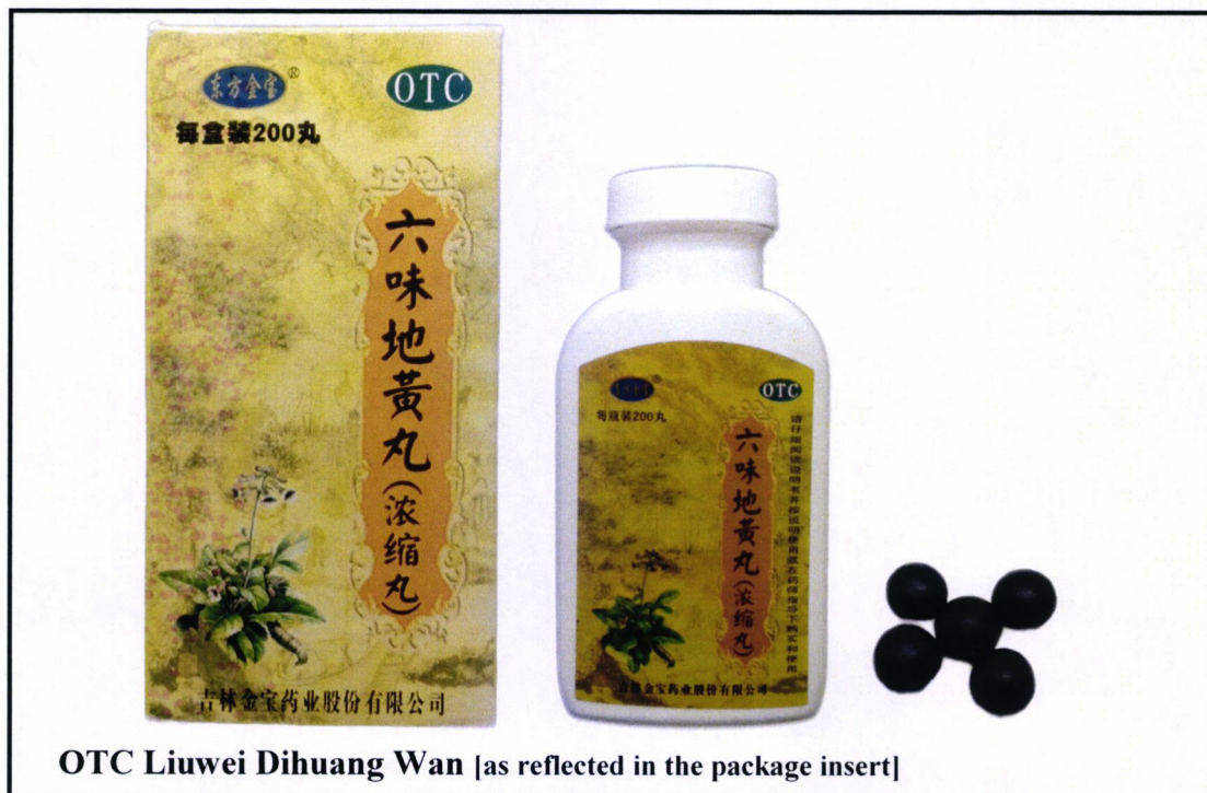
OTC Liuwei Dihuang Wan [as reflected in the package insert]

The Food and Drug Administration (FDA) advises the public against the purchase and use of the following unregistered drug products: