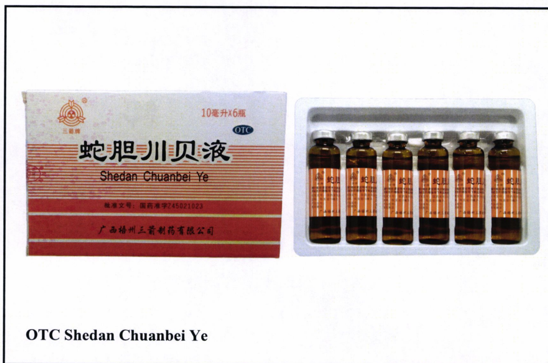
OTC Shedan Chuanbei Ye

The Food and Drug Administration (FDA) advises the public against the purchase and use of the following unregistered drug products: