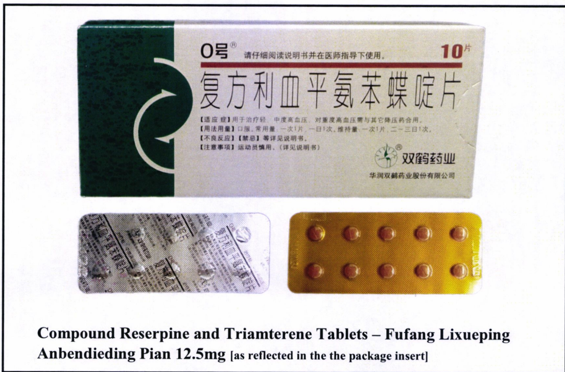
Compound Reserpine and Triamterene Tablets – Fufang Lixueping Anbendieding Pian 12.5mg [as reflected in the the package insert]