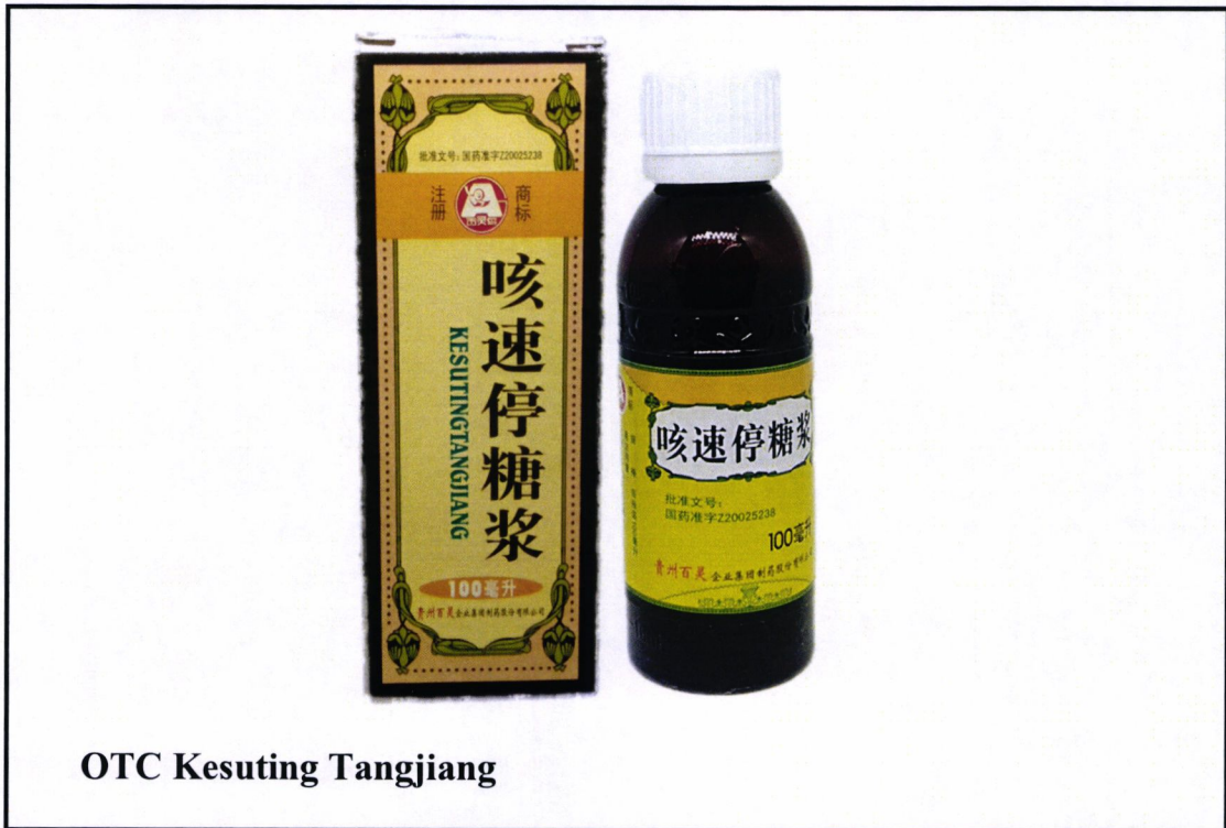
OTC Kesuting Tangjiang