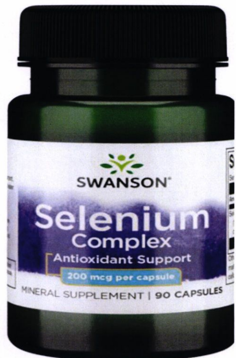
Figure 4. Unregistered SWANSON Selenium Complex, Antioxidant Support, 200mcg, Mineral Supplement, 90 Capsules