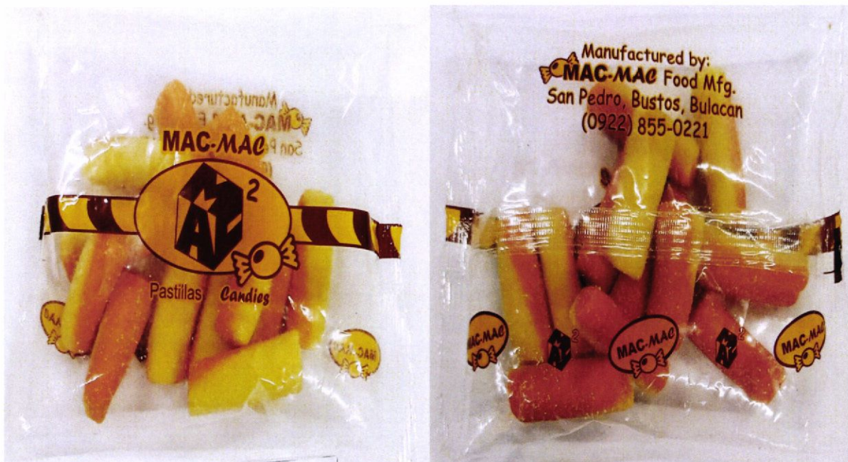
Figure 1. Unregistered MAC MAC Pastillas, Candy

The Food and Drug Administration (FDA) warns all healthcare professionals and the general public NOT TO PURCHASE AND CONSUME the following unregistered food products and food supplements: