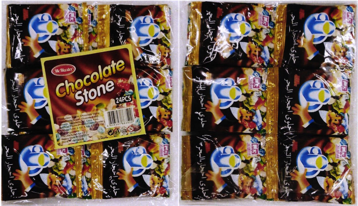
Figure 2. Unregistered MC MASTER Chocolate Stone, 24pcs