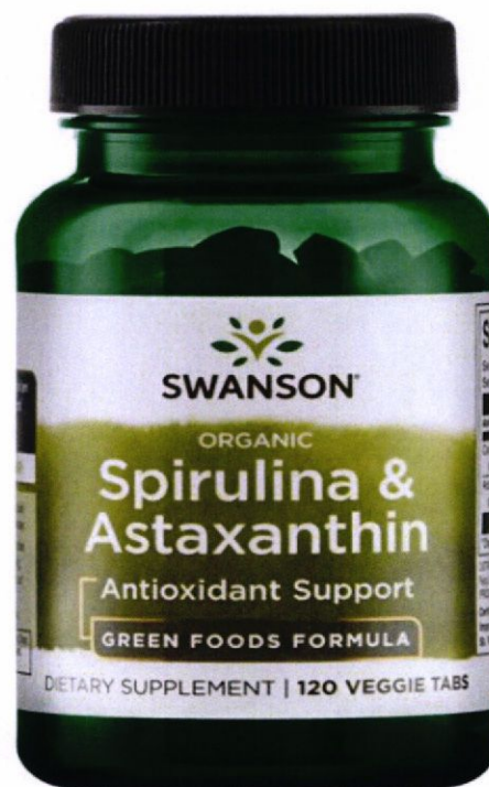
Figure 3. Unregistered SWANSON Organic Spirulina & Astaxanthin Antioxidant Support, Green Foods Formula, Dietary Supplement, 120 Veggie Tabs