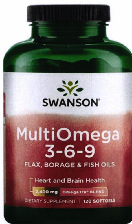
Figure 5. Unregistered SWANSON MultiOmega 3-6-9, Flax, Borage & Fish Oils, Heart and Brain Health, 2400mg OmegaTru Blend, Dietary Supplement, 120 Softgels