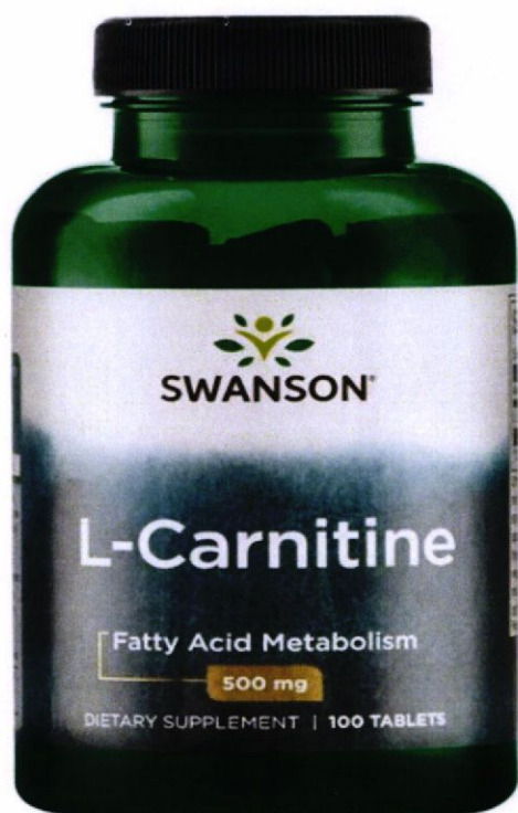
Figure 2. Unregistered SWANSON L-Carnitine, Fatty Acid Metabolism, 500mg, Dietary Supplement, 100 Tablets