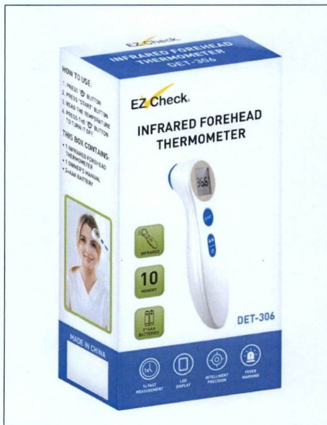
Figure 1. Unregistered EZ Check Infrared Forehead Thermometer

The Food and Drug Administration (FDA) warns all healthcare professionals and the general public NOT TO PURCHASE AND USE the unregistered medical device products: