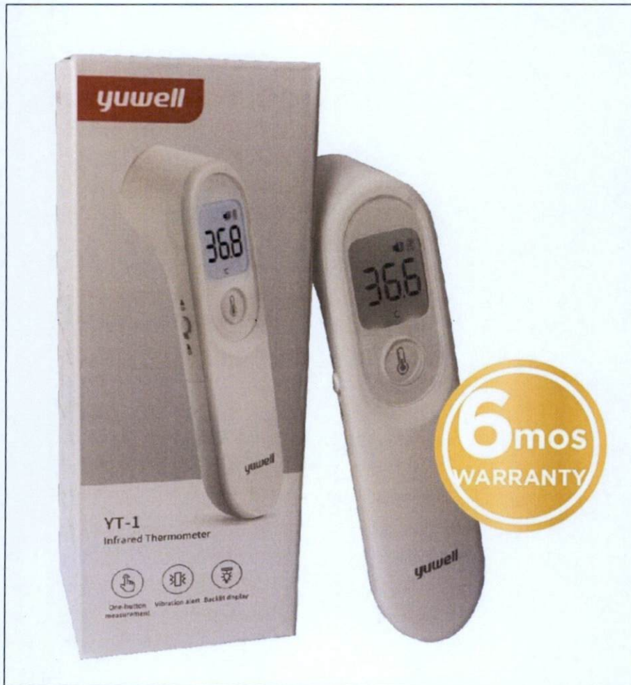
Figure 3. Unregistered Yuwell Blue Cross YT-1 Infrared Thermometer