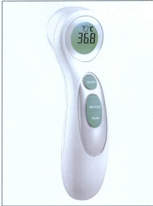
Figure 2. Unregistered HEALMED Infrared Forehead Thermometer