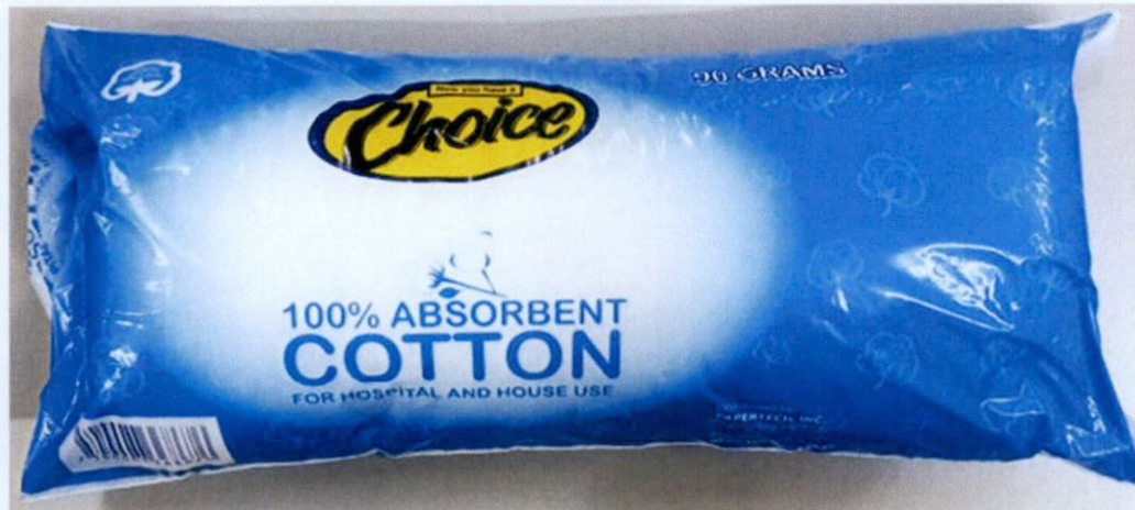
Figure 1. Unnotified Choice – 100% Absorbent Cotton – 90 grams

The Food and Drug Administration (FDA) warns all healthcare professionals and the general public NOT TO PURCHASE AND USE the unnotified medical device product: