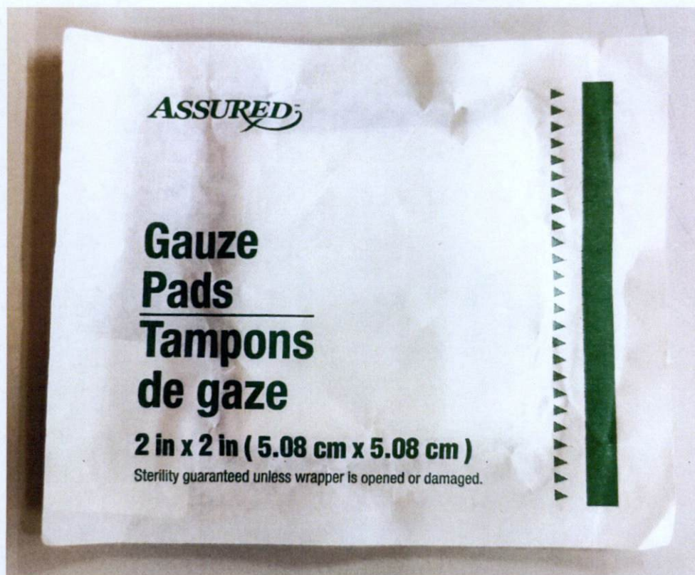
Figure 1. Unnotified Assured Gauze Pads (Tampons de Gaze)

The Food and Drug Administration (FDA) warns all healthcare professionals and the general public NOT TO PURCHASE AND USE the unnotified medical device product: