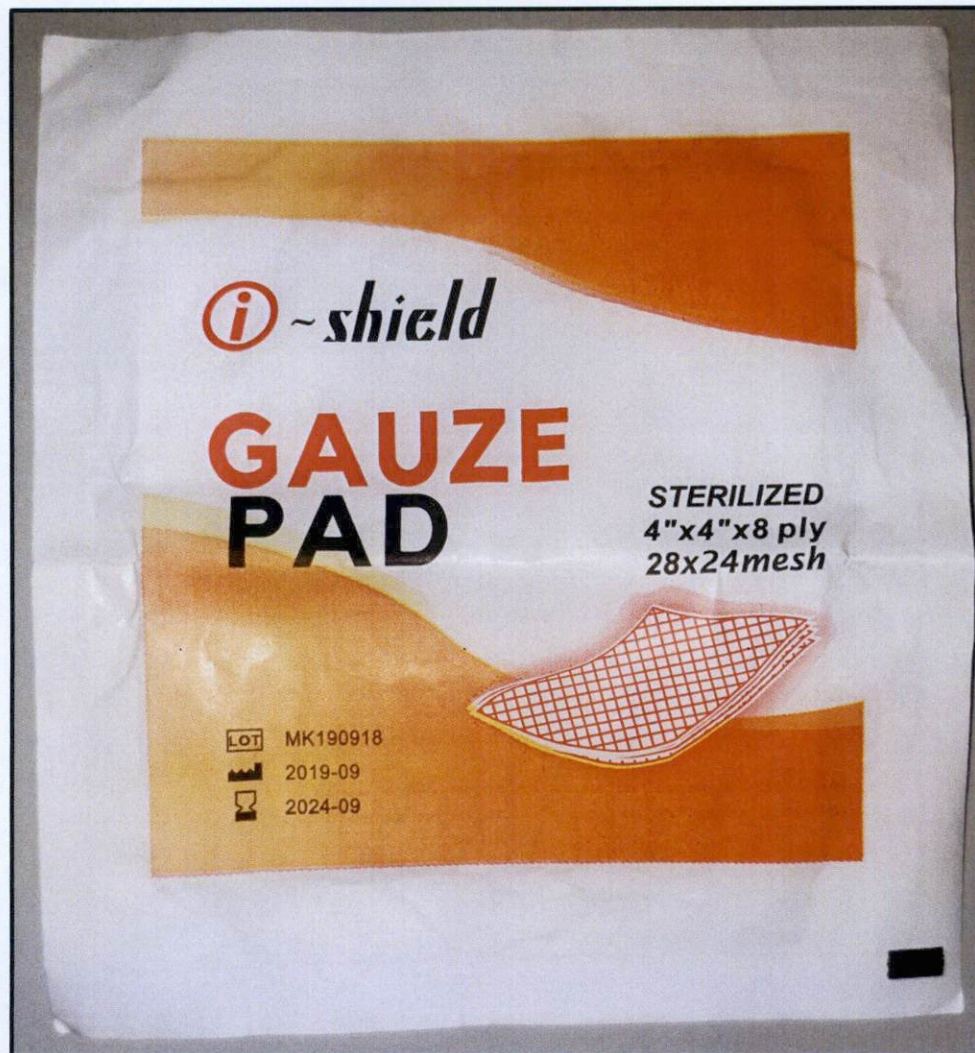
Figure 1. Unnotified i-Shield Gauze Pad Sterilized (4"x4"x8 ply 28x24 mesh)

The Food and Drug Administration (FDA) warns all healthcare professionals and the general public NOT TO PURCHASE AND USE the unnotified medical device product: