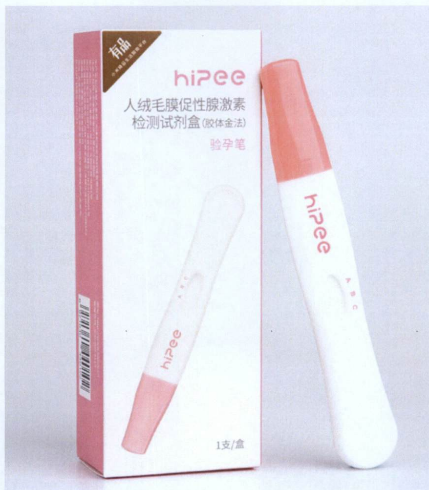
Figure 1. Unregistered Xiaomi Youpin HiPee Pregnancy Test Kit (Model: MI0506)

The Food and Drug Administration (FDA) warns all healthcare professionals and the general public NOT TO PURCHASE AND USE the unregistered medical device product: