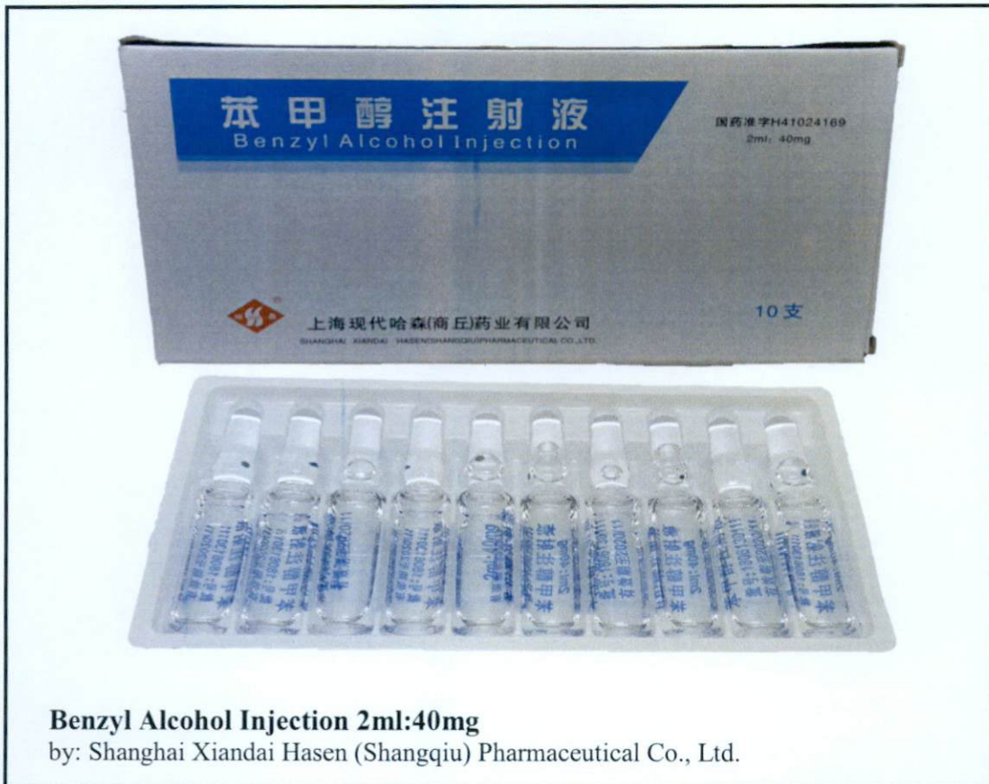
Figure 5. Unregistered drug product