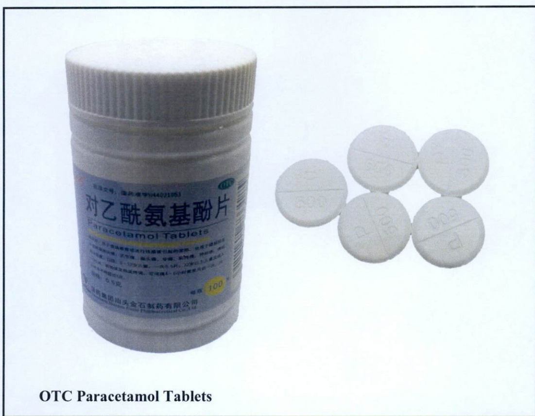
OTC Paracetamol Tablets