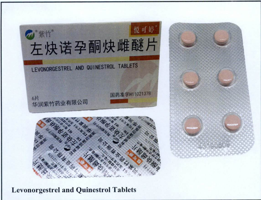
Levonorgestrel and Quinestrol Tablets