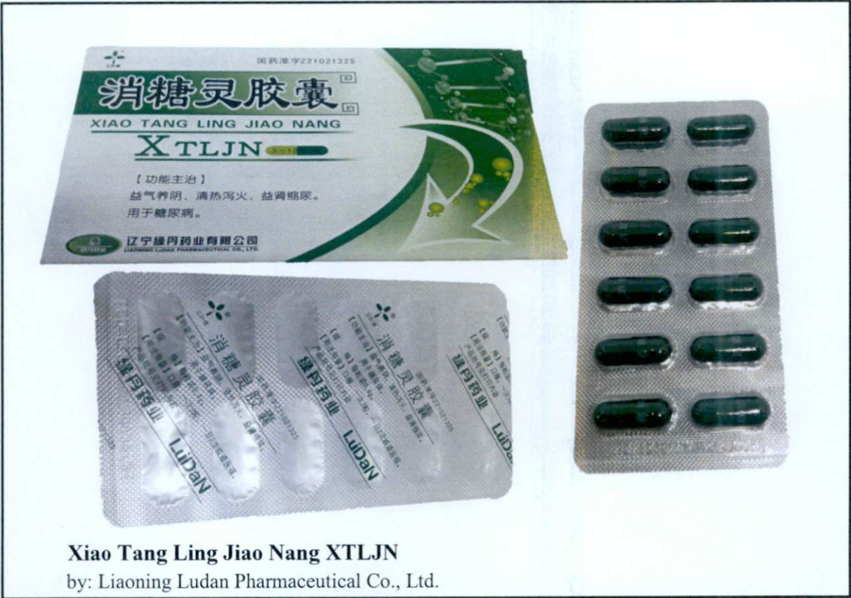
Xiao Tang Ling Jiao Nang XTLJN by: Liaoning Ludan Pharmaceutical Co., Ltd.