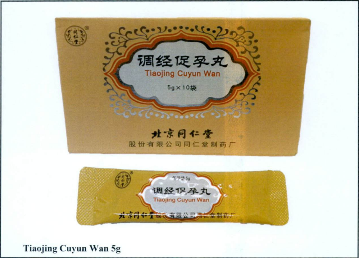
Tiaojing Cuyun Wan 5g