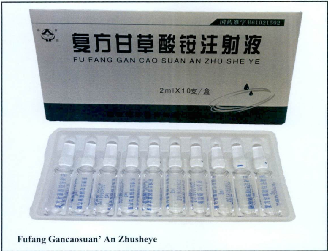
Fufang Gancuosuan' An Zhusheye