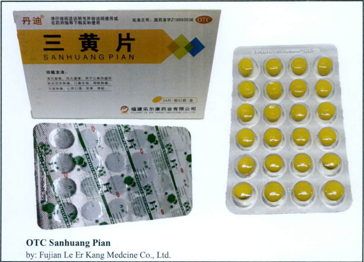
Figure 3. Unregistered drug product