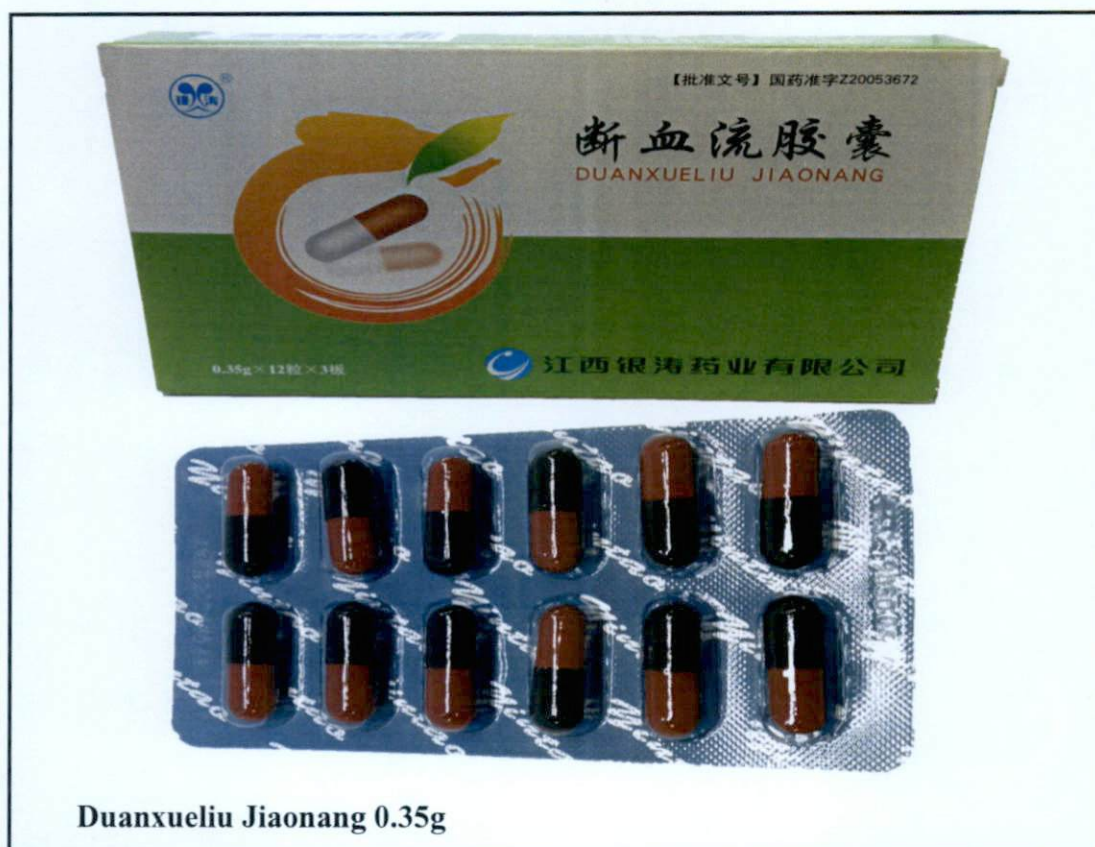
Figure 1. Unregistered drug product

The Food and Drug Administration (FDA) advises the public against the purchase and use of the following unregistered drug products: