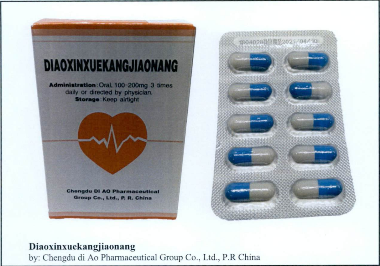
Figure 2. Unregistered drug product