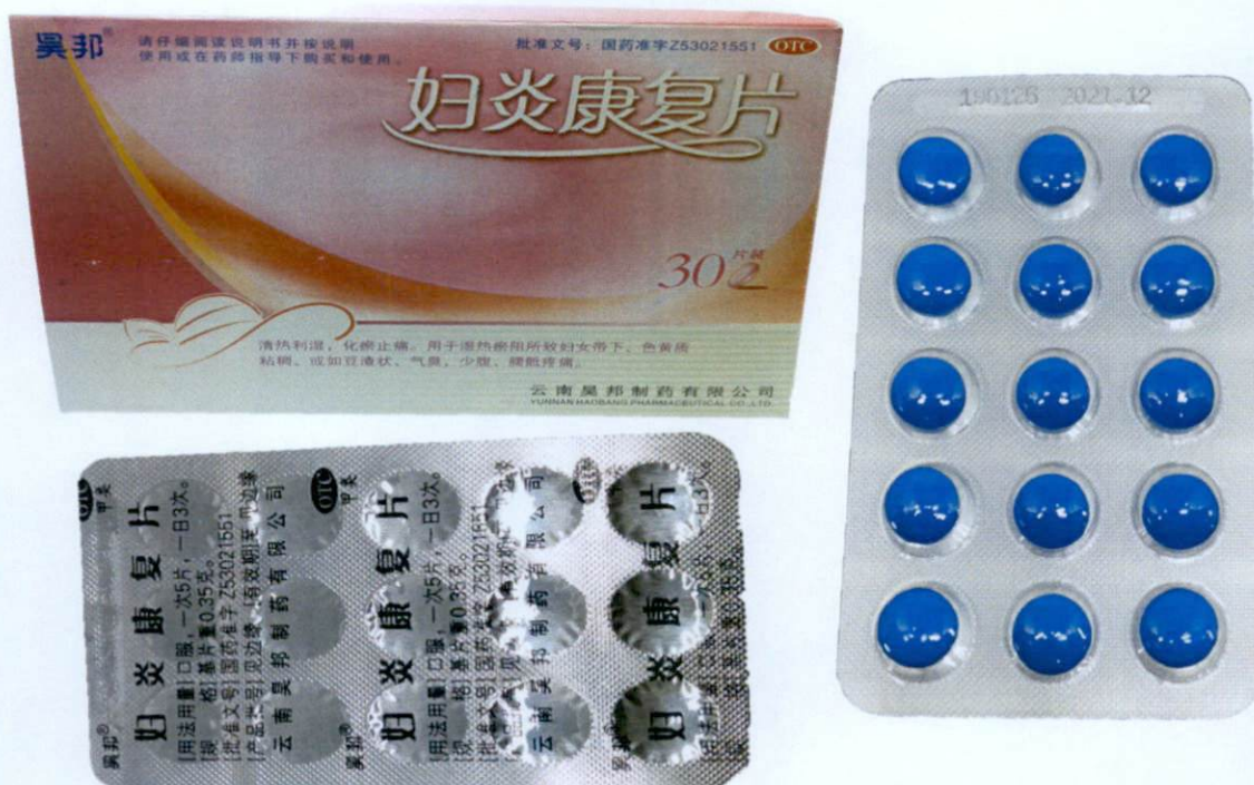
OTC Fuyan Kangfu Pian [as reflected in the package insert] by: Yunnan Haobang Pharmaceutical Co., Ltd.