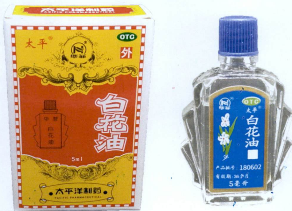
OTC Baihua You 5ml by: Fujian Pacific Pharmaceutical Co., Ltd.