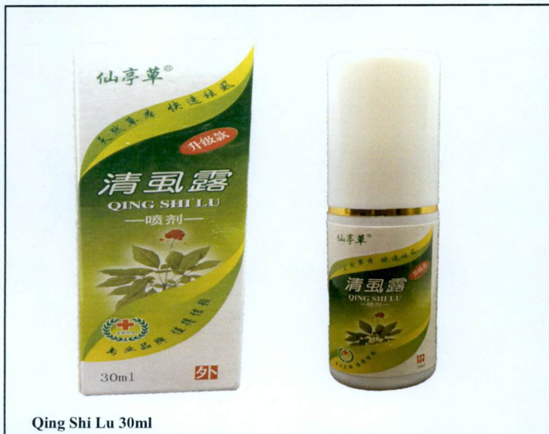
Qing Shi Lu 30ml

The Food and Drug Administration (FDA) advises the public against the purchase and use of the following unregistered drug products: