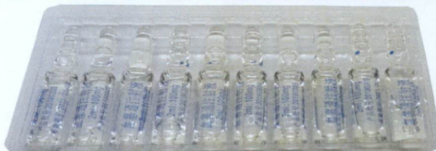
Xuesaitong Zhusheye 2ml:100mg