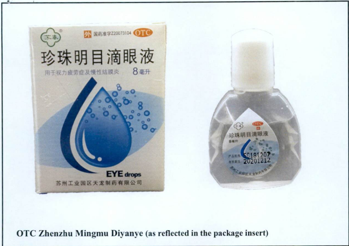
OTC Zhenzhu Mingmu Diyanye (as reflected in the package insert)