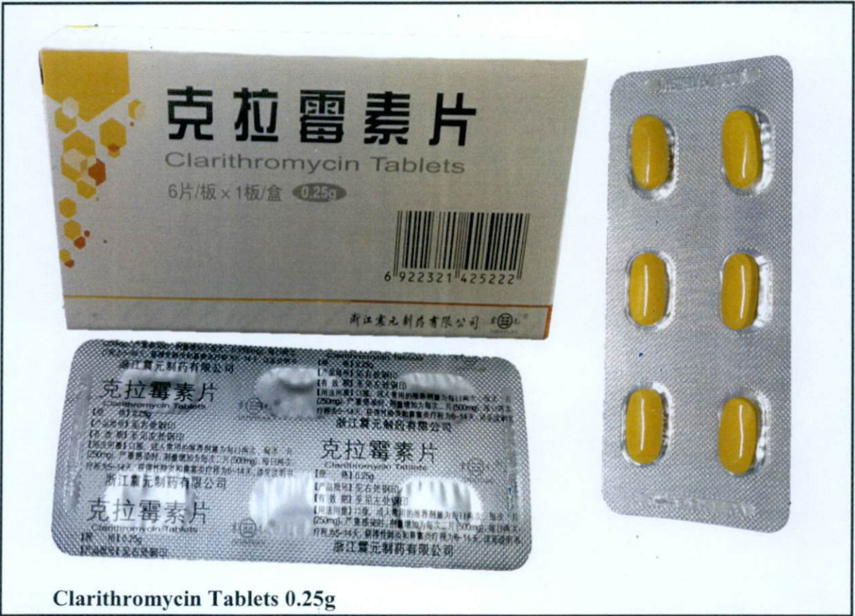
Clarithromycin Tablets 0.25g