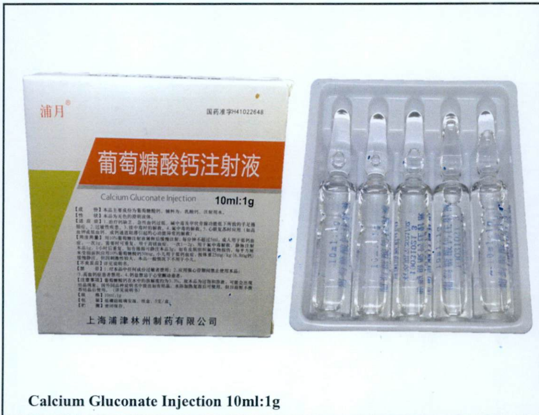
Calcium Gluconate Injection 10ml:1g