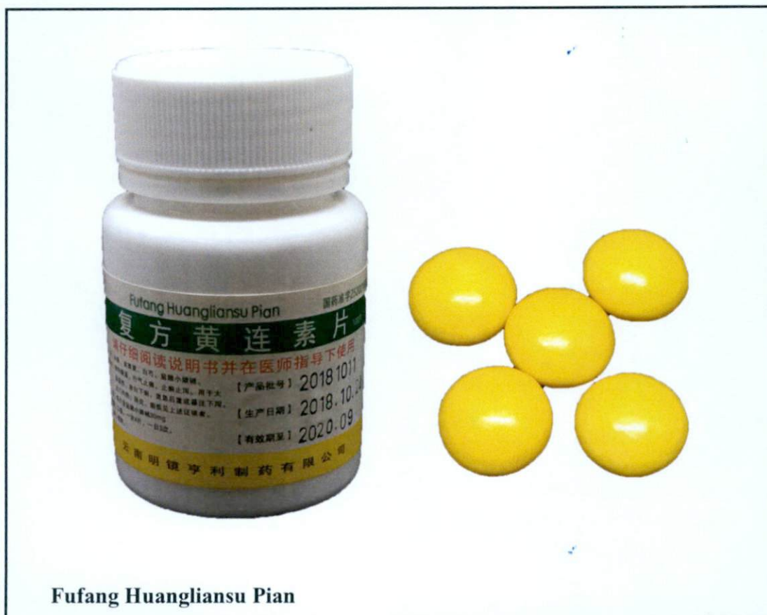
Fufang Huangliansu Pian

The Food and Drug Administration (FDA) advises the public against the purchase and use of the following unregistered drug products: