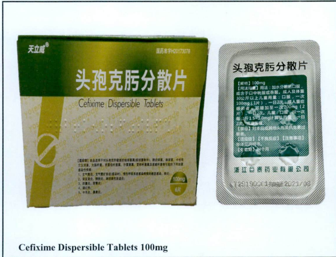
Cefixime Dispersible Tablets 100mg