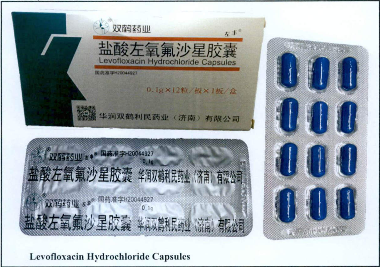
Levofloxacin Hydrochloride Capsules