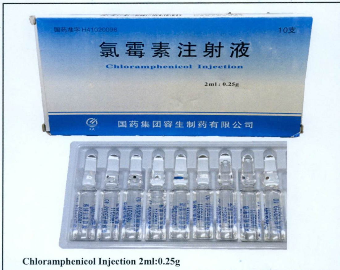
Chloramphenicol Injection 2ml:0.25g

The Food and Drug Administration (FDA) advises the public against the purchase and use of the following unregistered drug products: