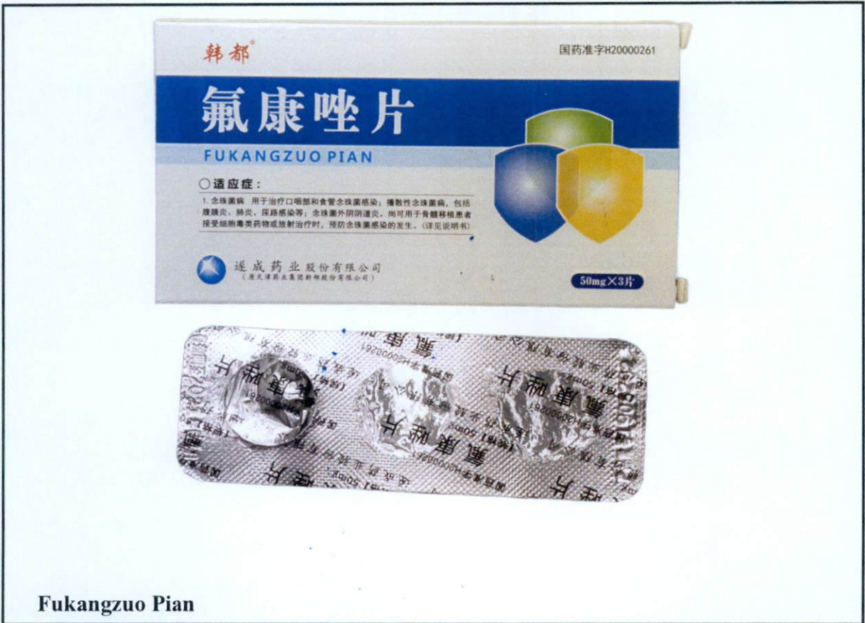
Figure 3. Unregistered drug product