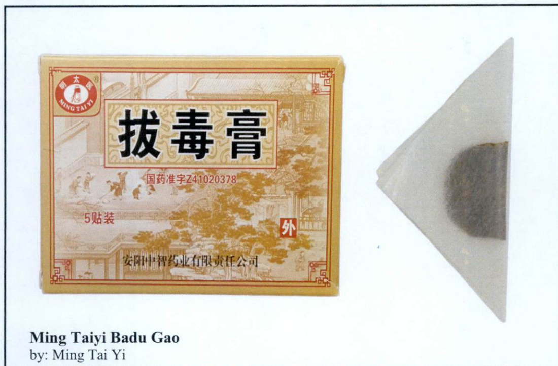
Ming Taiyi Badu Gao by: Ming Tai Yi

The Food and Drug Administration (FDA) advises the public against the purchase and use of the following unregistered drug products: