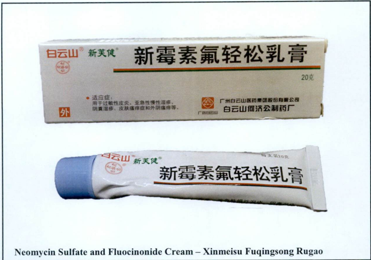
Figure 2. Unregistered drug product