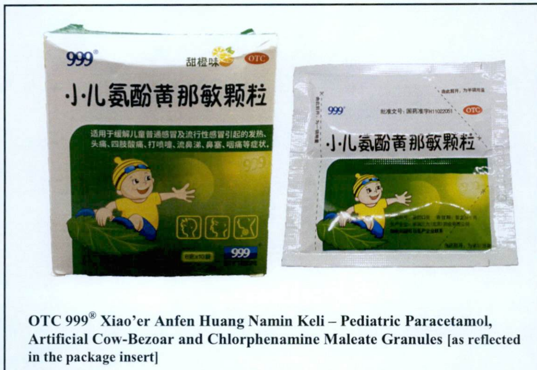
Figure 1. Unregistered drug product

The Food and Drug Administration (FDA) advises the public against the purchase and use of the following unregistered drug products: