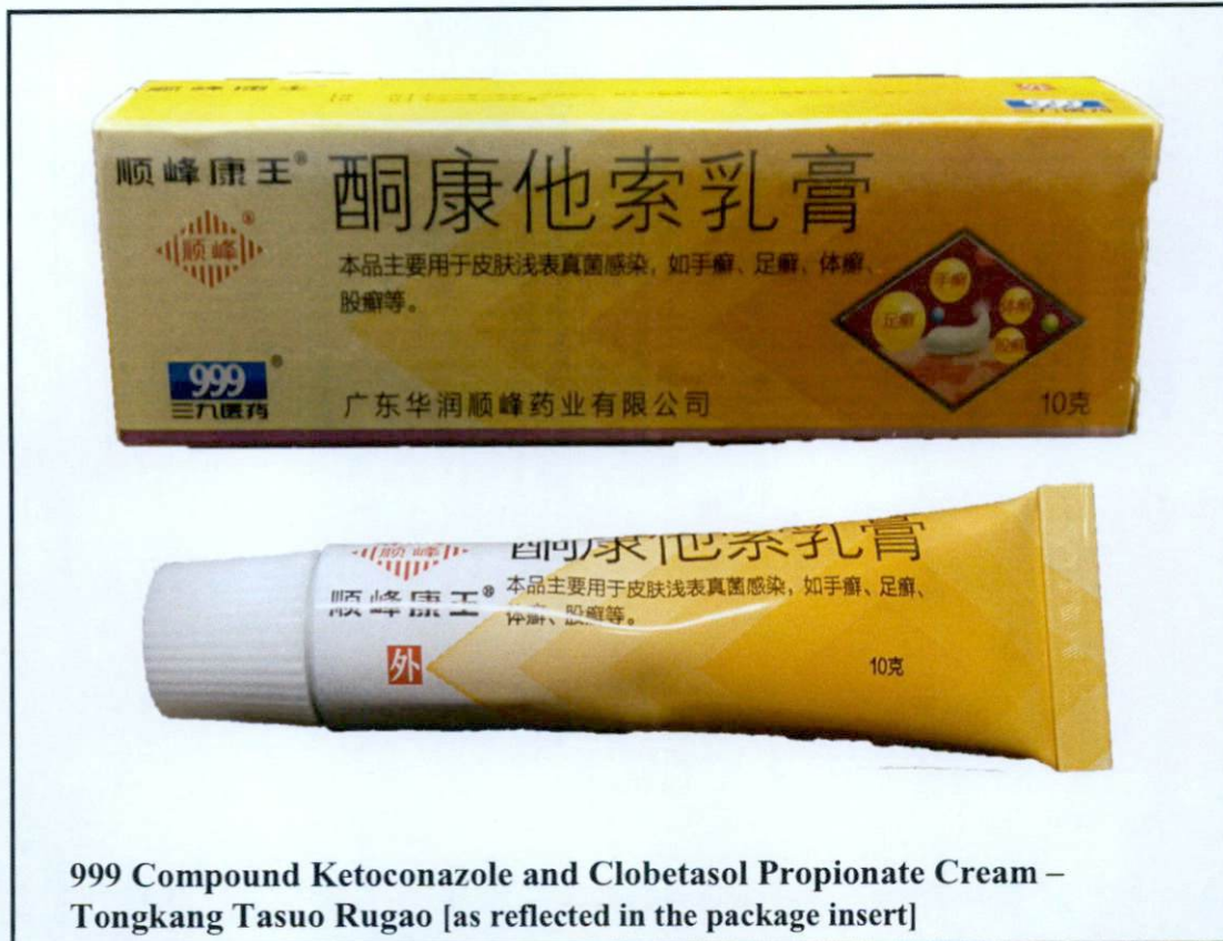
Figure 4. Unregistered drug product

FDA Post-Marketing Surveillance (PMS) activities have verified that the abovementioned drug products have not gone through the registration process of the Agency and have not been issued with proper authorization in the form of Certificate of Product Registration. Thus, the Agency cannot guarantee its quality, safety and efficacy. Therefore, consumption of such violative products may pose potential danger or injury to health.