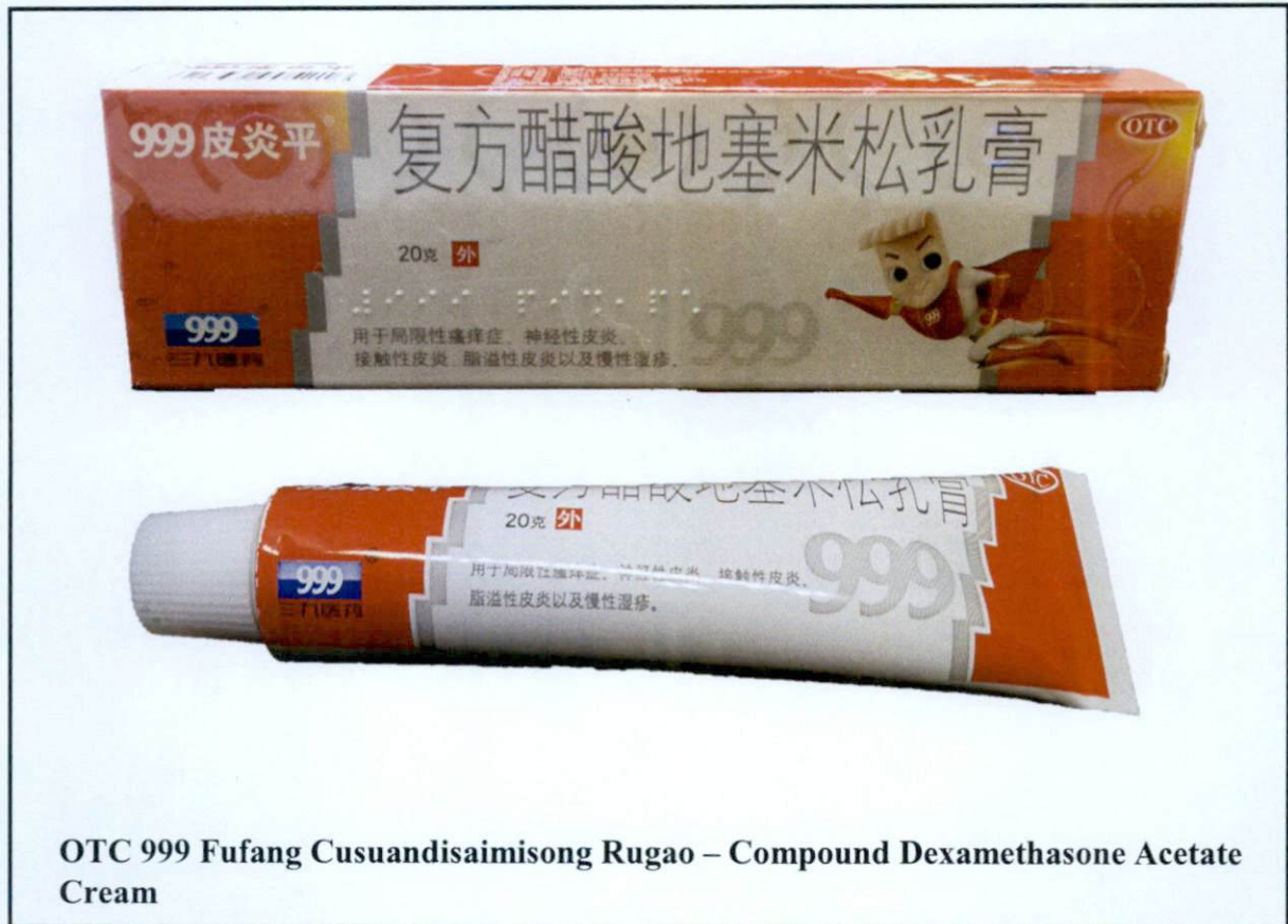
Figure 3. Unregistered drug product