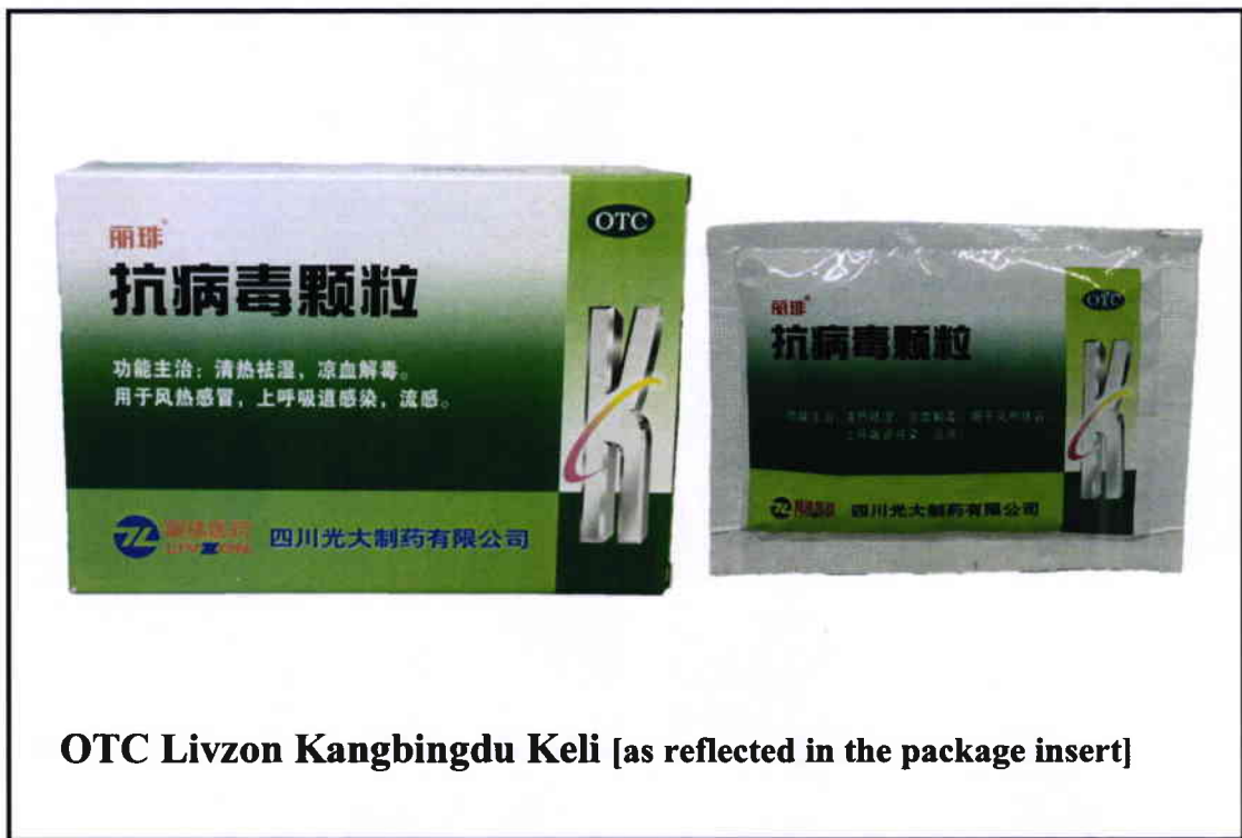
OTC Livzon Kangbingdu Keli [as reflected in the package insert]