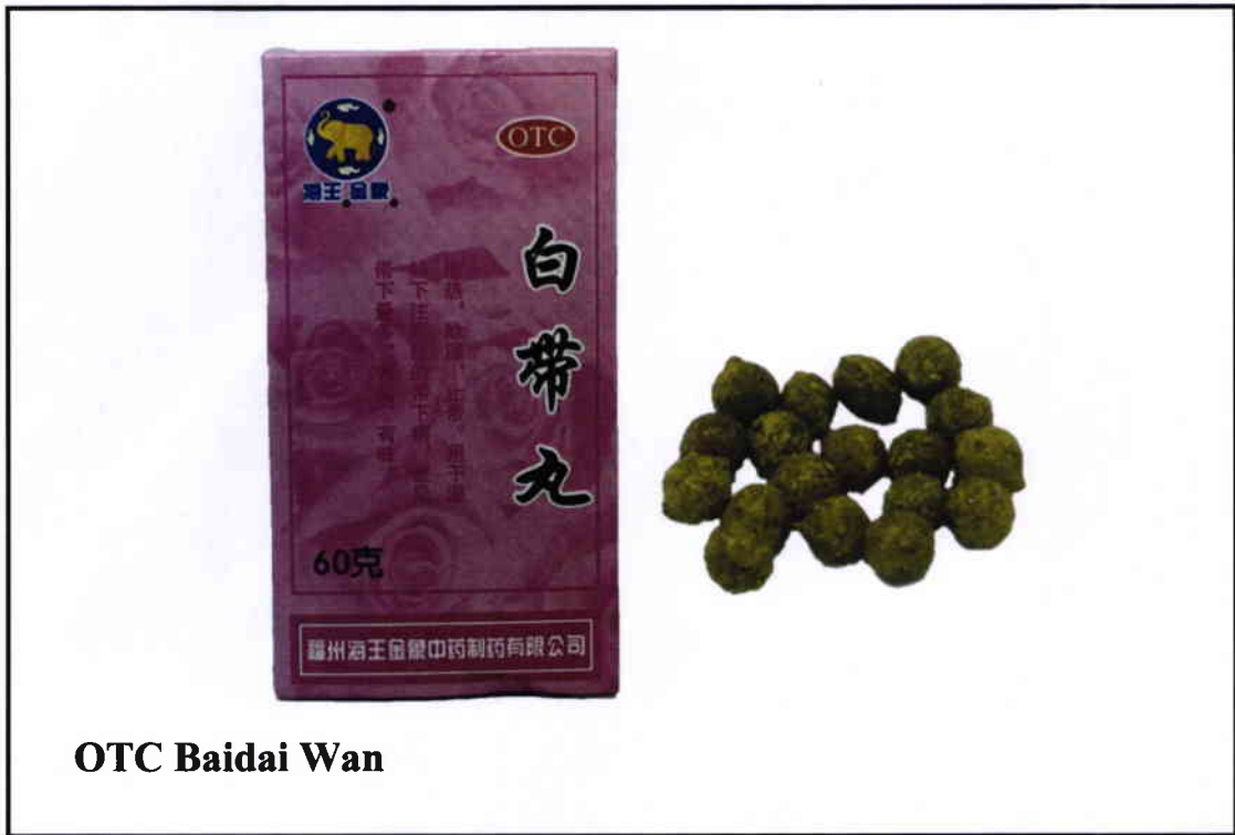
OTC Baidai Wan