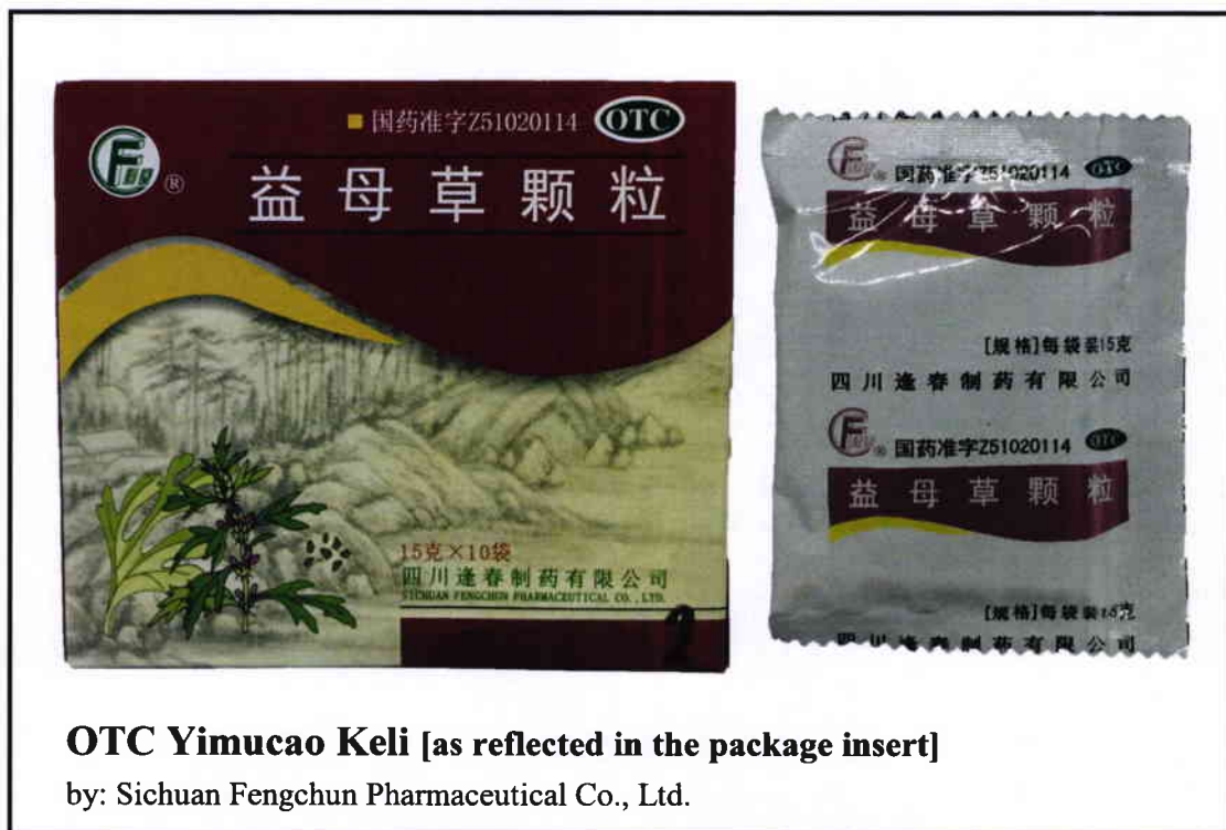
OTC Yimucao Keli [as reflected in the package insert] by: Sichuan Fengchun Pharmaceutical Co., Ltd.