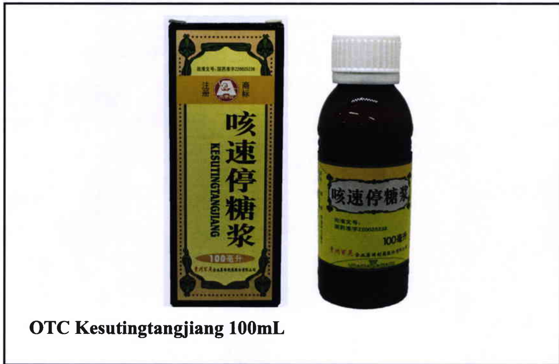
OTC Kesutingtangjiang 100mL