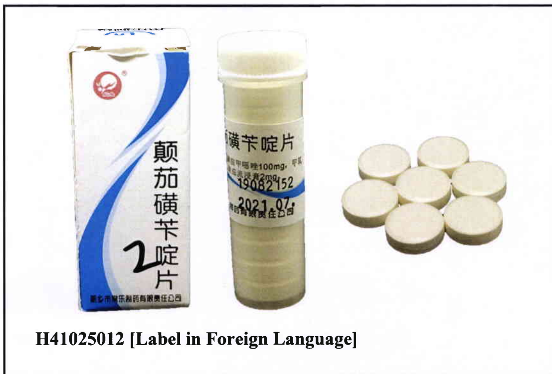
H41025012 [Label in Foreign Language]

The Food and Drug Administration (FDA) advises the public against the purchase and use of the following unregistered drug products: