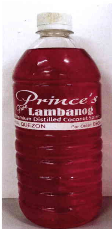
Figure 5. Unregistered PRINCE'S Pure Lambanog Premium Distilled Coconut Spirit – Red, 1Liter