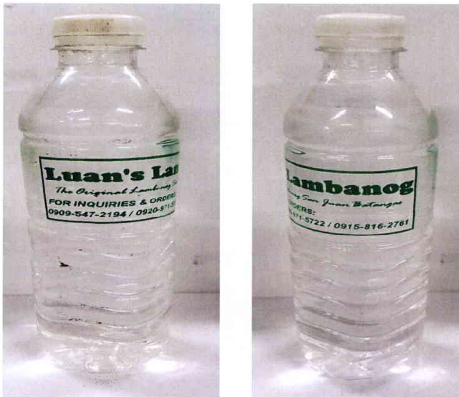
Figure 3. Unregistered LUAN'S Lambanog, 300ml