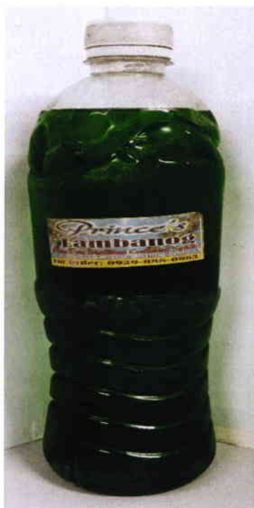
Figure 4. Unregistered PRINCE'S Pure Lambanog Premium Distilled Coconut Spirit – Green, 300ml