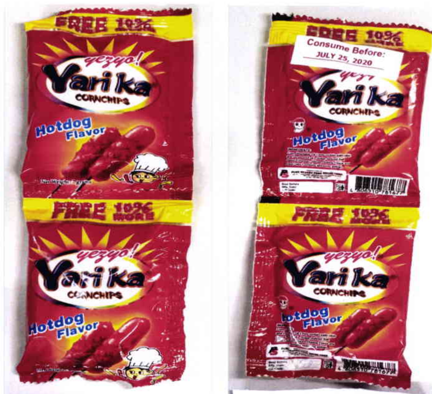
Figure 1. Unregistered YEZYO! Yari Ka Cornchips– Hotdog Flavor, 7g

The Food and Drug Administration (FDA) warns all healthcare professionals and the general public NOT TO PURCHASE AND CONSUME the following unregistered food products: