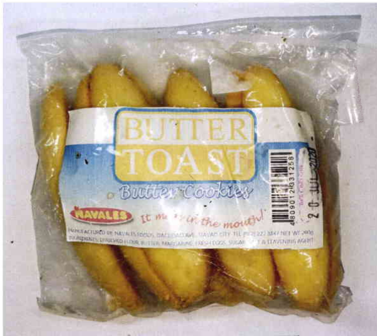
Figure 1. Unregistered NAVALES BUTTER TOAST Butter Cookies

The Food and Drug Administration (FDA) warns all healthcare professionals and the general public NOT TO PURCHASE AND CONSUME the following unregistered food products: