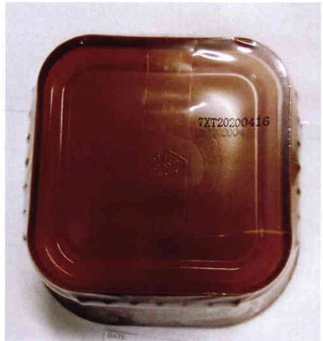
Figure 4. Unregistered Instant Noodles in Brown Tupperware Tub (In Foreign Language)