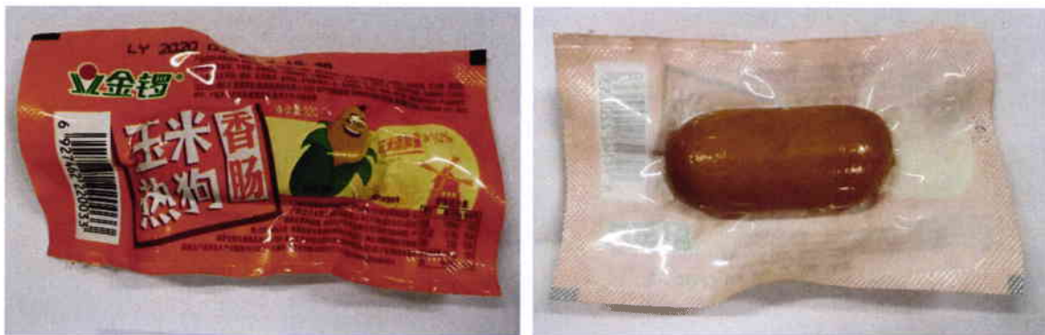
Figure 1. Unregistered Sausage with Corn Image in Orange Vacuum Sealed Packaging (In Foreign Language)

The Food and Drug Administration (FDA) warns all healthcare professionals and the general public NOT TO PURCHASE AND CONSUME the following unregistered food products: