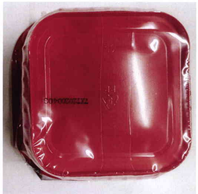
Figure 3. Unregistered Instant Noodles with Chili and Sesame Seeds in Red Tupperware Tub (In Foreign Language)