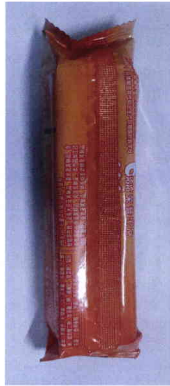
Figure 2. Unregistered CHACHEER Crackers in Orange Packaging (In Foreign Language)