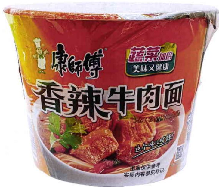
Figure 5. Unregistered Instant Noodles with Beef and Chili in Orange Paper Bowl Packaging (In Foreign Language)