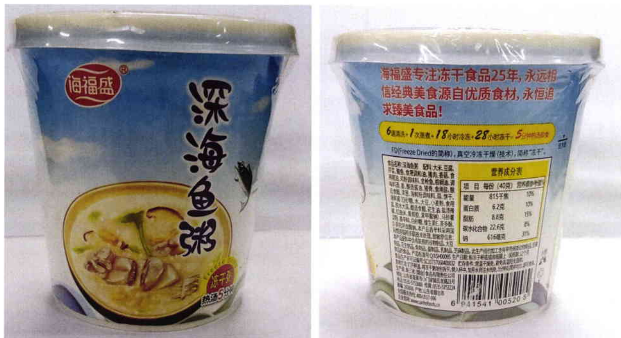
Figure 5. Unregistered Instant Porridge with Mushroom in Light Blue and White Paper Cup Packaging (In Foreign Language)