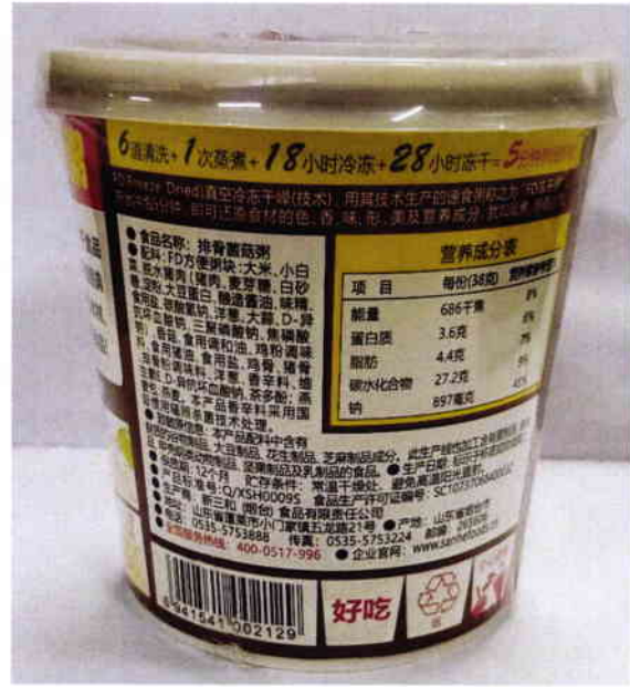
Figure 2. Unregistered HAIFUSHENG Instant Porridge with Chicken Neck in White and Brown Plastic Cup Packaging (In Foreign Language)