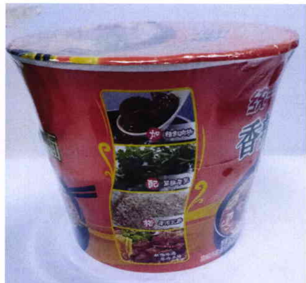
Figure 1. Unregistered UNI-PRESIDENT Instant Noodles with Beef and Chili in Orange Paper Bowl Packaging (In Foreign Language)