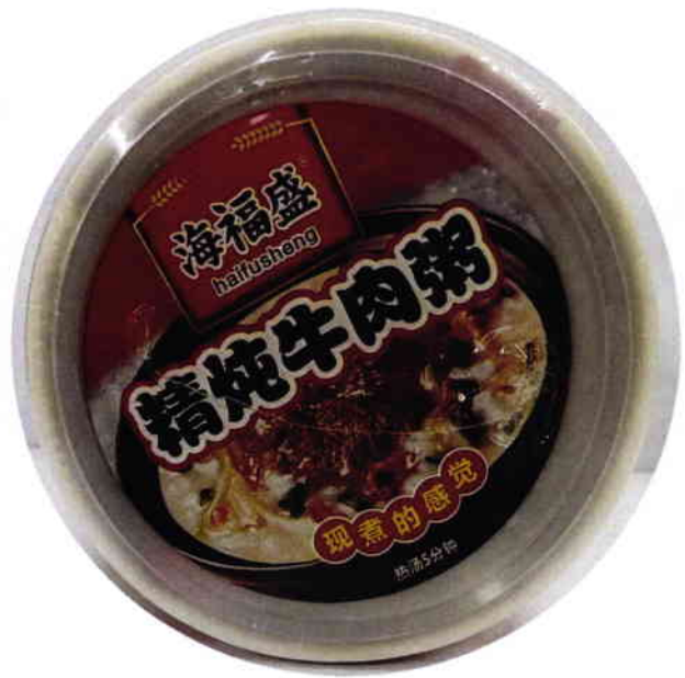
Figure 3. Unregistered HAIFUSHENG Instant Porridge with Beef in White and Red Paper Cup Packaging (In Foreign Language)