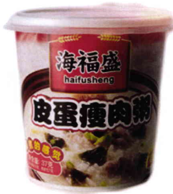
Figure 4. Unregistered HAIFUSHENG Instant Porridge Paper Cup Packaging (In Foreign Language)