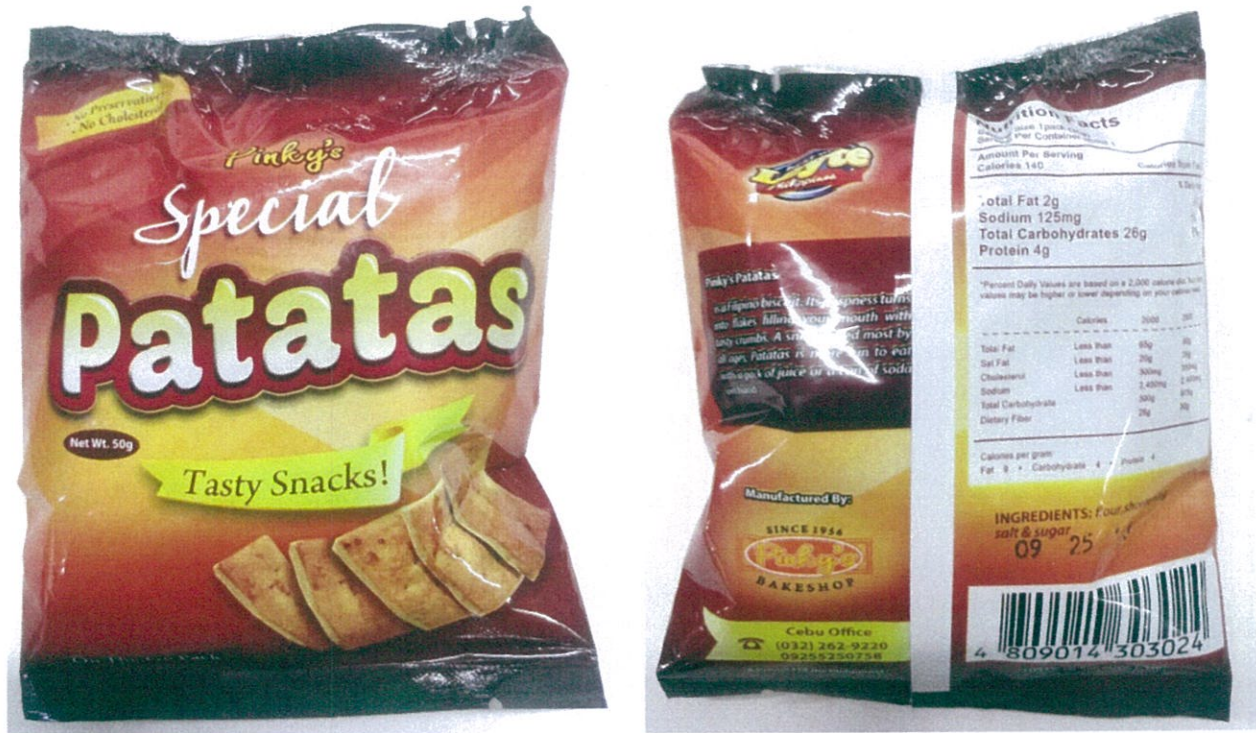
Figure 3. Unregistered PINKY'S Special Patatas, 50g