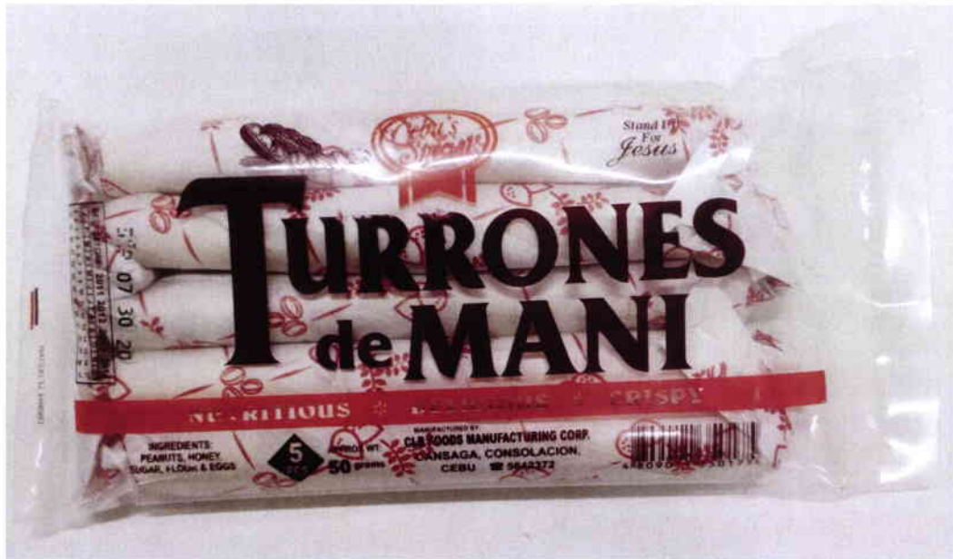
Figure 5. Unregistered CEBU'S SPECIAL Turrone de Mani, 50g