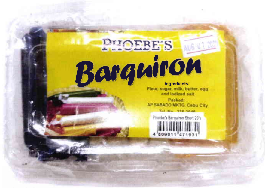
Figure 4. Unregistered PHOEBE'S Barquiron Shorts